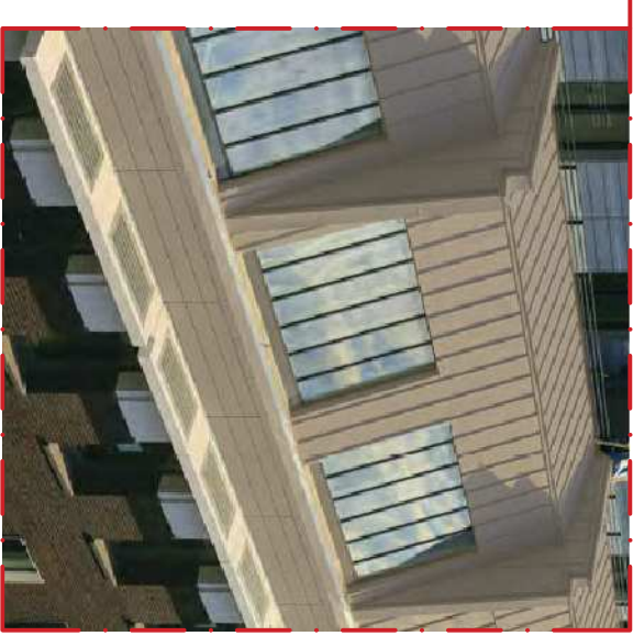
Pigmento zinc cladding to roof extension