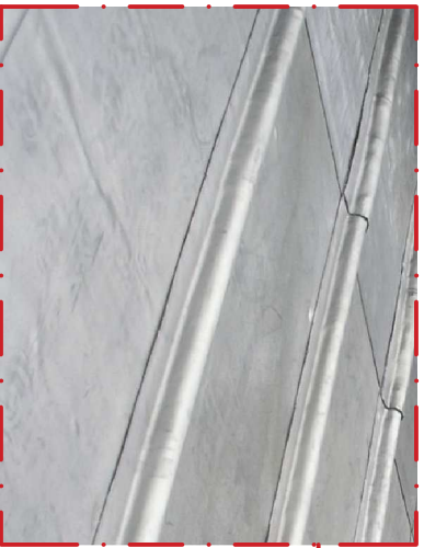
Standing seam lead cladding to 5th floor rear elevation