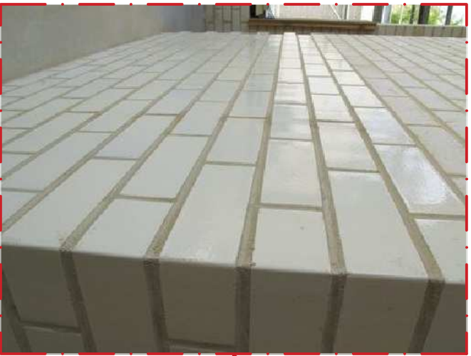
16 stock Kleiwaren London white Glazed brick WT07. Dark colour mortar.