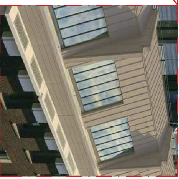
Pigmento zinc cladding to 3rd floor and to roof of 5th floor extension