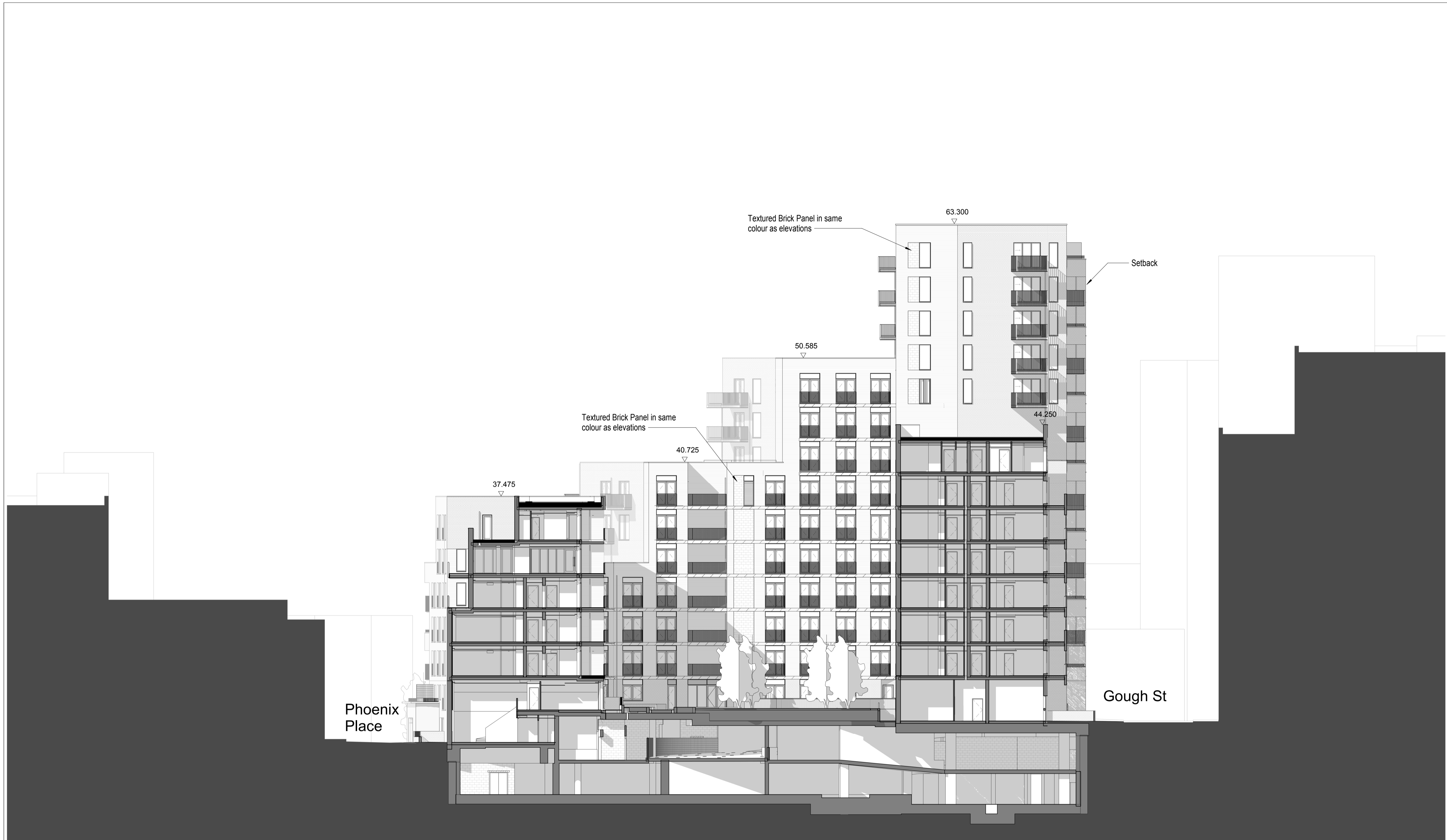
1 Courtyard South Elevation - Planning Scale 1 : 200

Reference list: List all external references and models used, this must include the revision e.g. MP1-AA-B1-SL-M3-A31-030001 REV A (Architectural Revit model Block 1) MP1-BB-B1-SL-M3-A21-020002 REV C (Structural Revit model Block 1) MP1-ZZ-B1-SL-M3-A71-050001 REV B (MEP Revit model Block 1 - Mechanical) MP1-ZZ-B1-SL-M3-A71-060001 REV D (MEP Revit model Block 1 - Electrical) 4607-T-G-REV B (Topological Survey) etc.