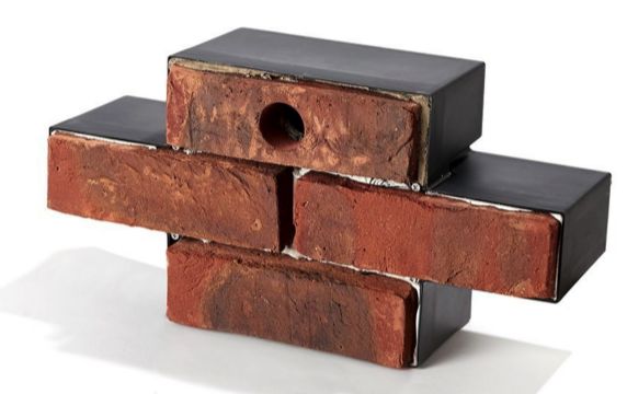
Integrated bird and bat box from www.birdbrickhouses.co.uk with facing brick to match development