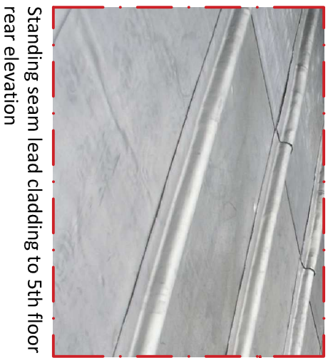
Standing seam lead cladding to 5th floor rear elevation