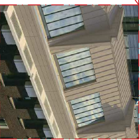
Pigmento zinc cladding to 3rd floor and to roof of 5th floor extension