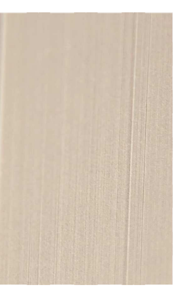
Bronze andodized finish to all new & replaced window frames