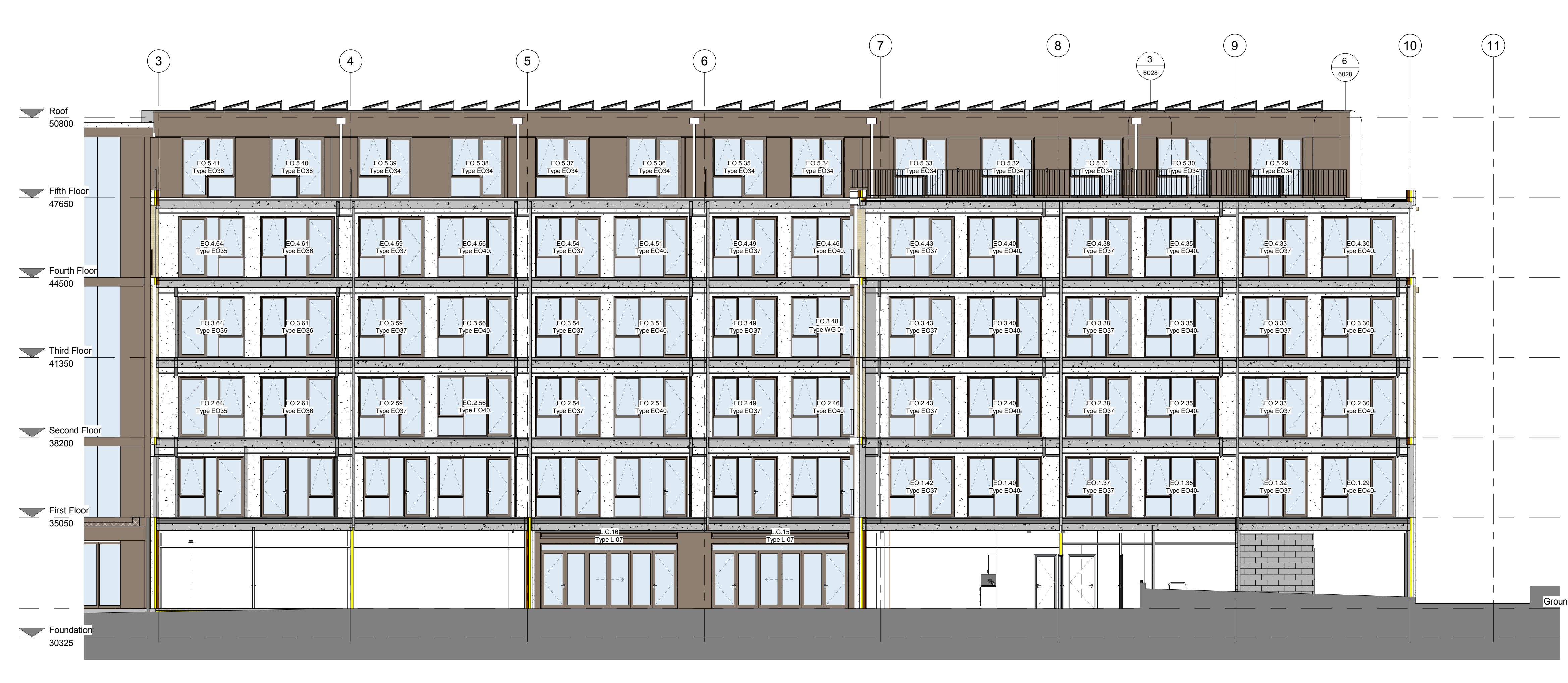
2 East Elevation taken through Wintergarden 1:100