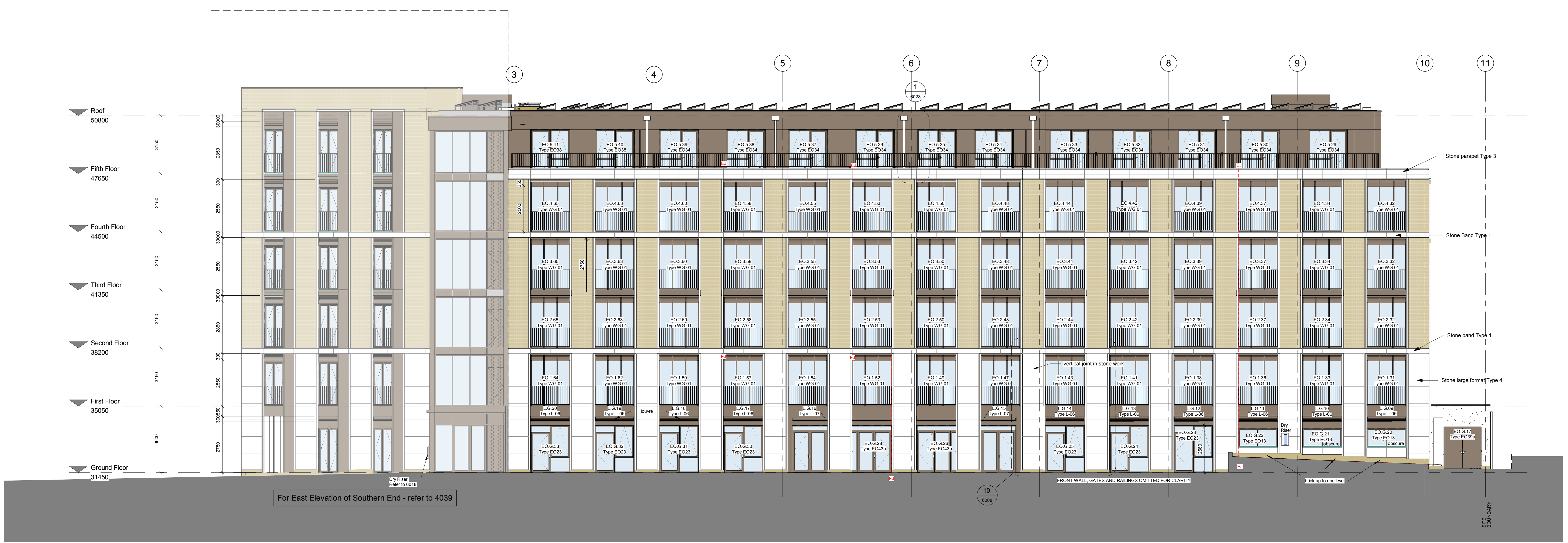
3 East Main Elevation 1:100

Horizontal movement joints located - second floor - fourth floor - tall brick parapet south elevation - stone parapet Refer to SE drawing for full detail