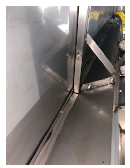
Pre and Post: Duct from canopy: