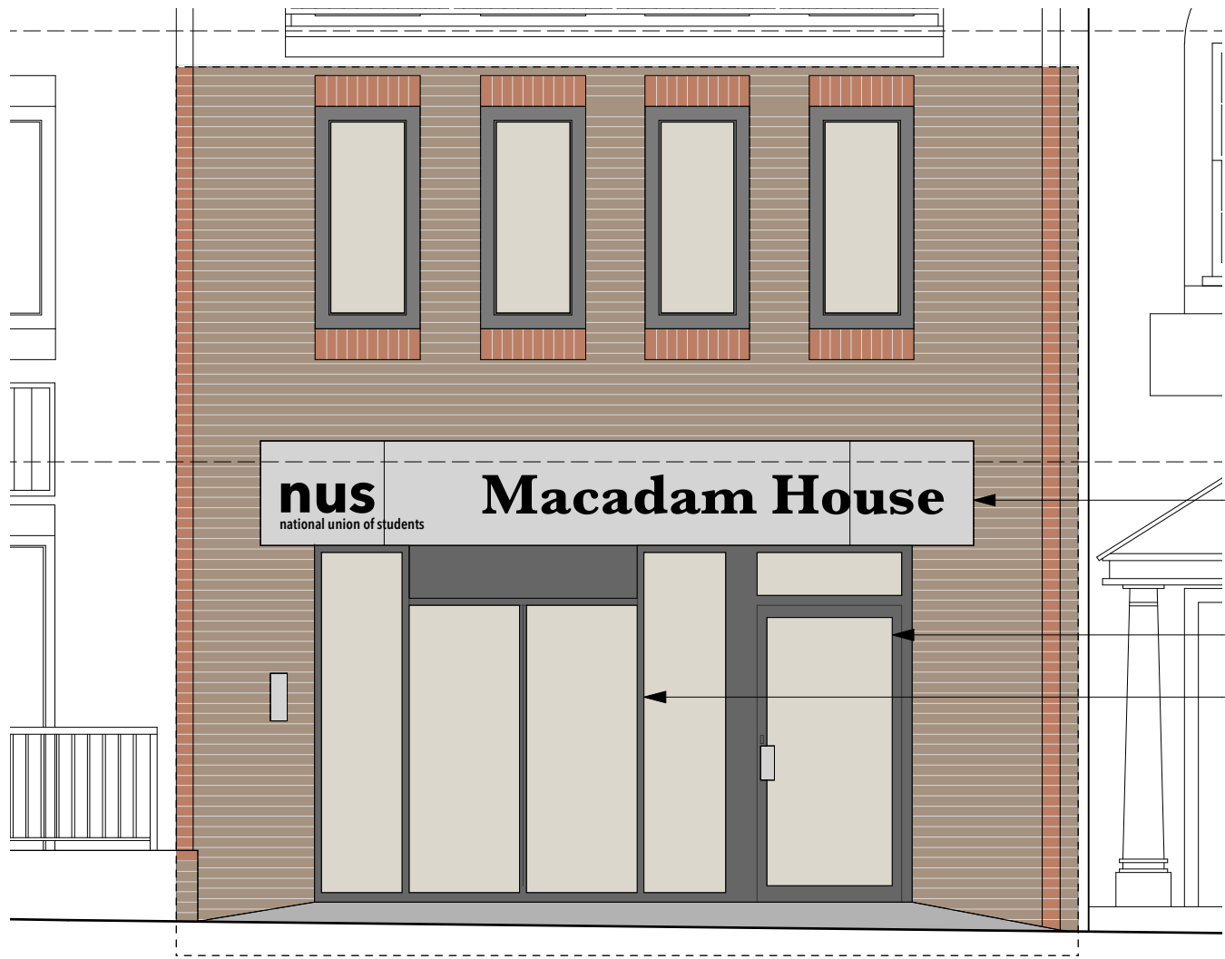
1 EXISTING ENTRANCE ELEVATION Scale: 1:25 @ A1/1:50 @ A3