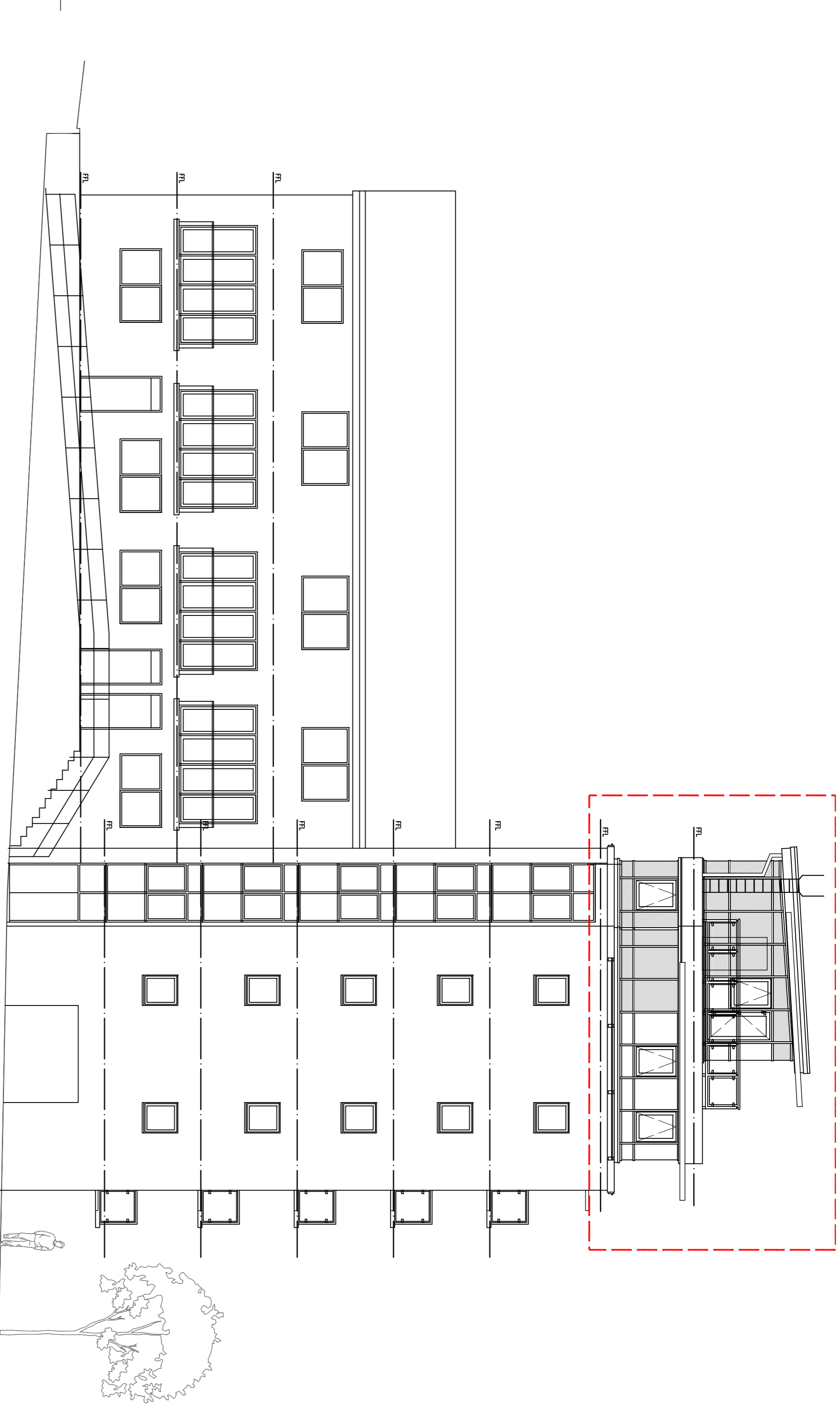
SIDE ELEVATION (WEST FACING)