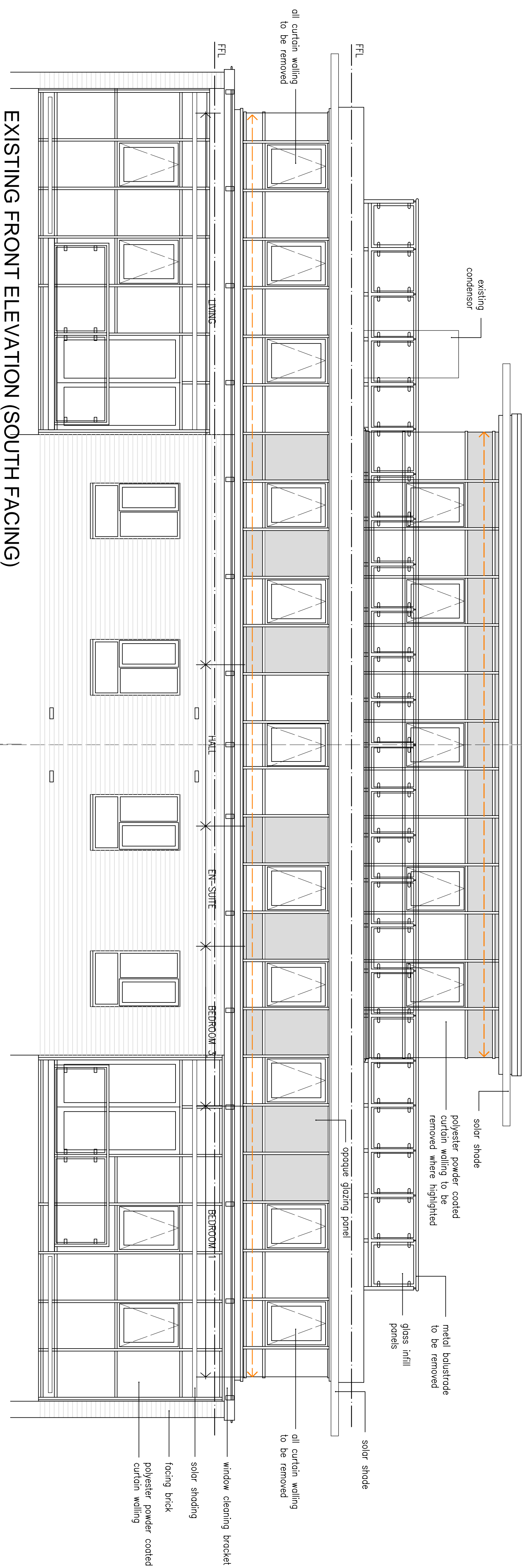
EXISTING FRONT ELEVATION (SOUTH FACING)