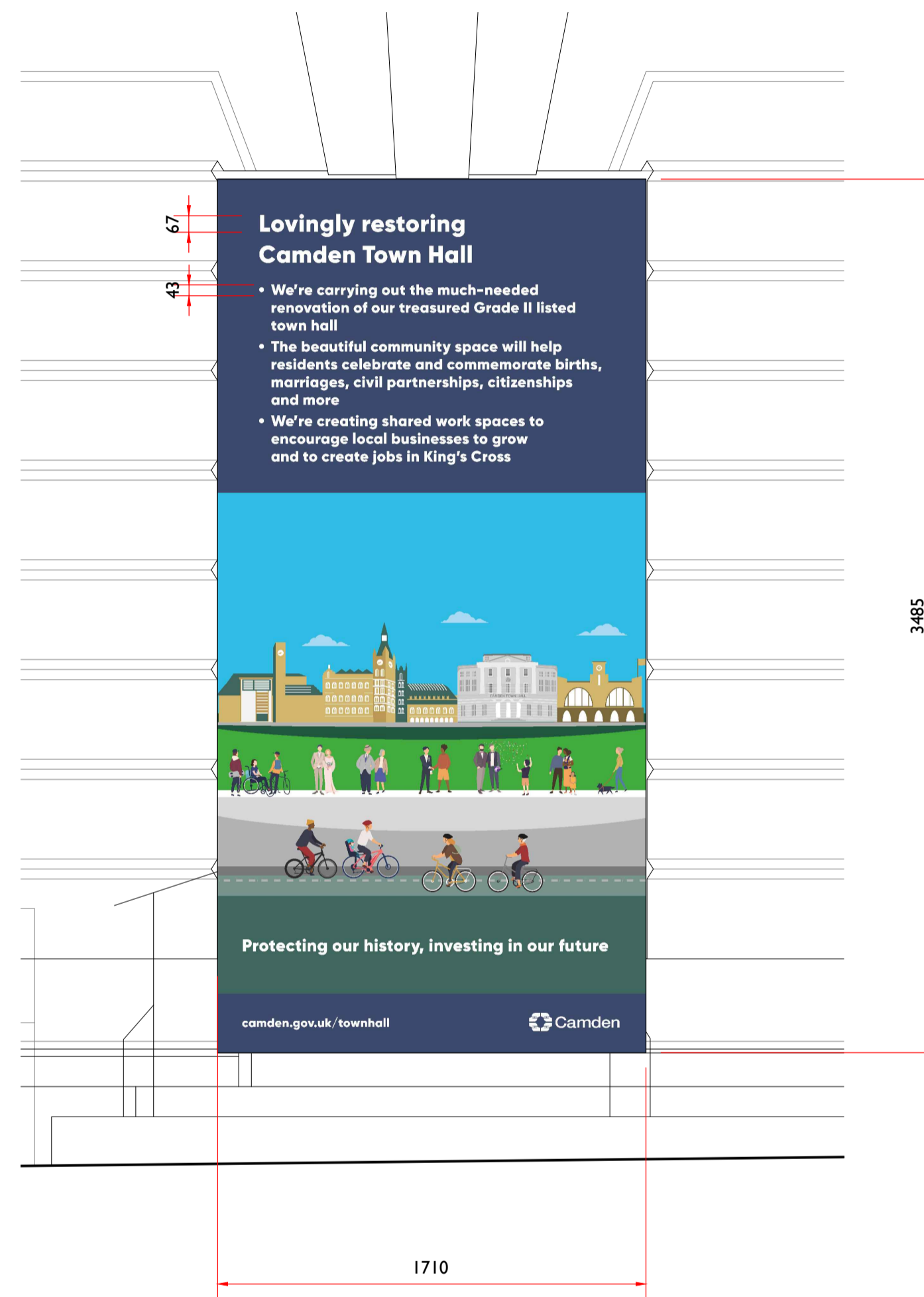
2 JUDD STREET ADVERTISING DIMENSIONS 9200 1:20 @ A1