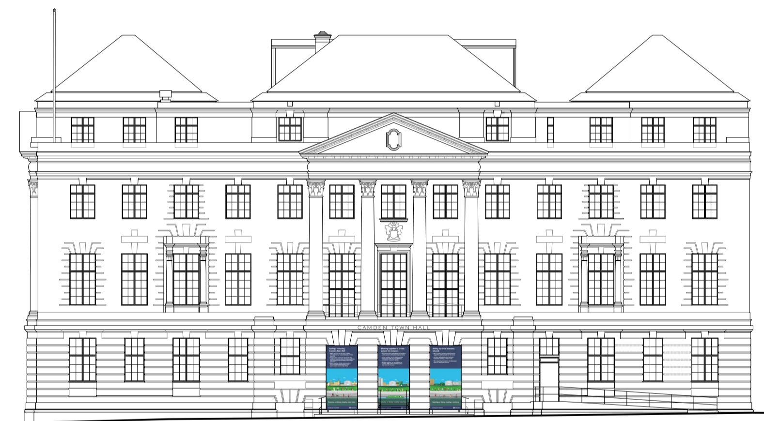
Camden Town Hall