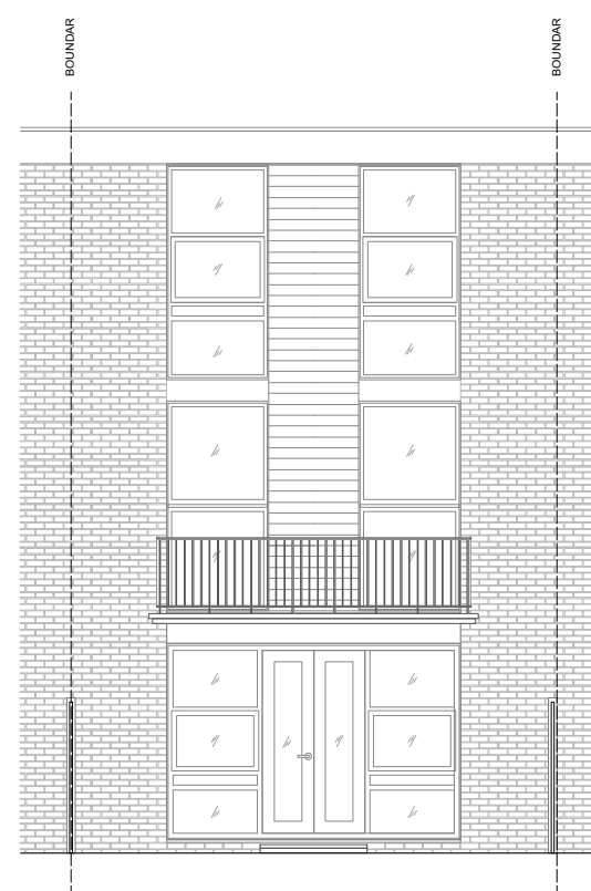
South Elevation (facing the garden)