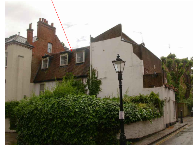
FRONT ELEVATION from Perrin's Lane