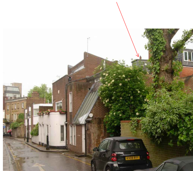
REAR ELEVATION from Perrin's Lane