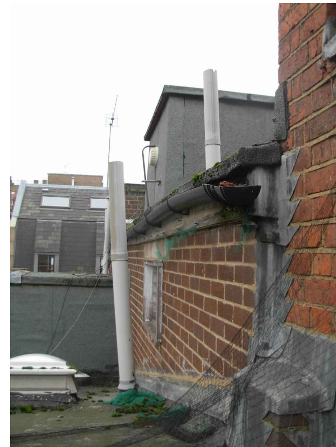
REAR ELEVATION from Prince Arthur Mews over adjacent property