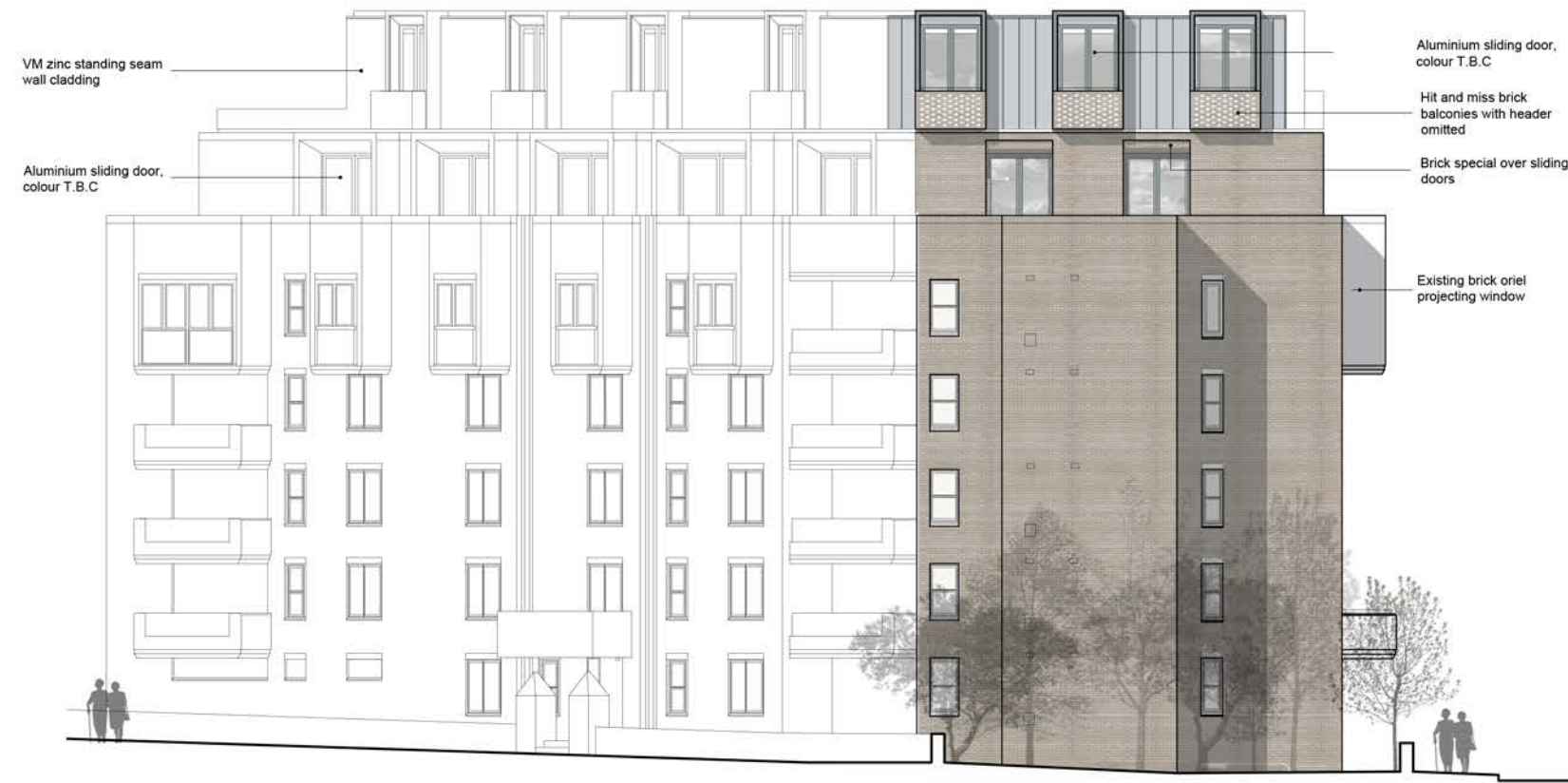
4 117 PROPOSED ELEVATION 5 1:200 @A3