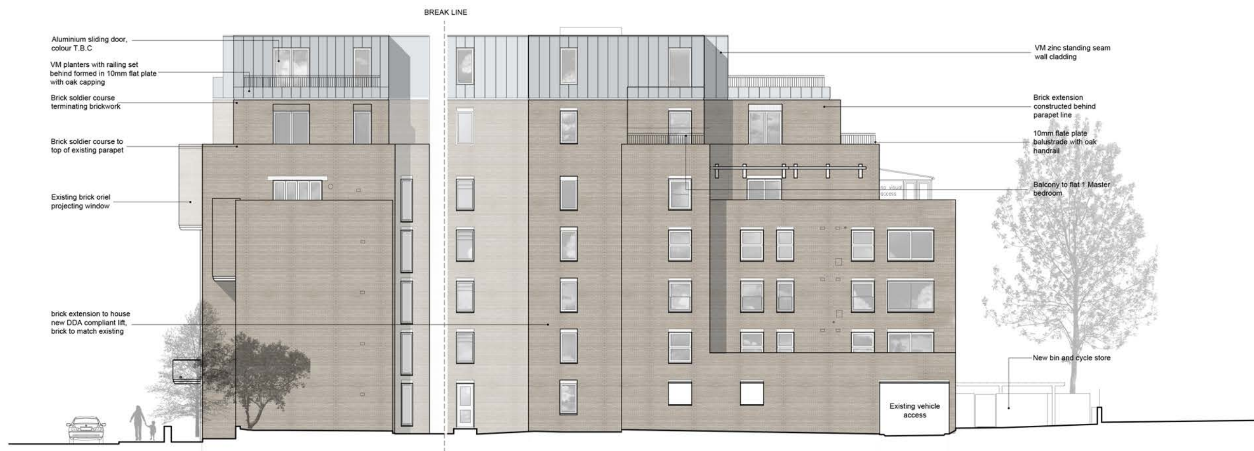
1 117 PROPOSED ELEVATION 3 1:200 @A3