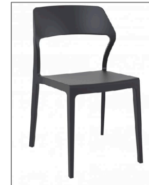
EXTERNAL CHAIR IN BLACK 84CM HIGH, 50CM WIDE, 45CM SEAT HEIGHT