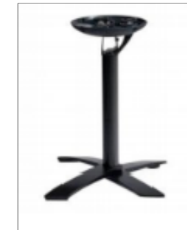
ADJUSTABLE EXTERNAL TABLE BASES IN BLACK ALUMINUM WITH MATCHING TOPS 69X69CM WIDTH 75CM HEIGHT