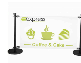
3 X WEIGHTED CAFE BARRIERS WITH 1 /2 M BRANDING IN BLACK AND WHITE