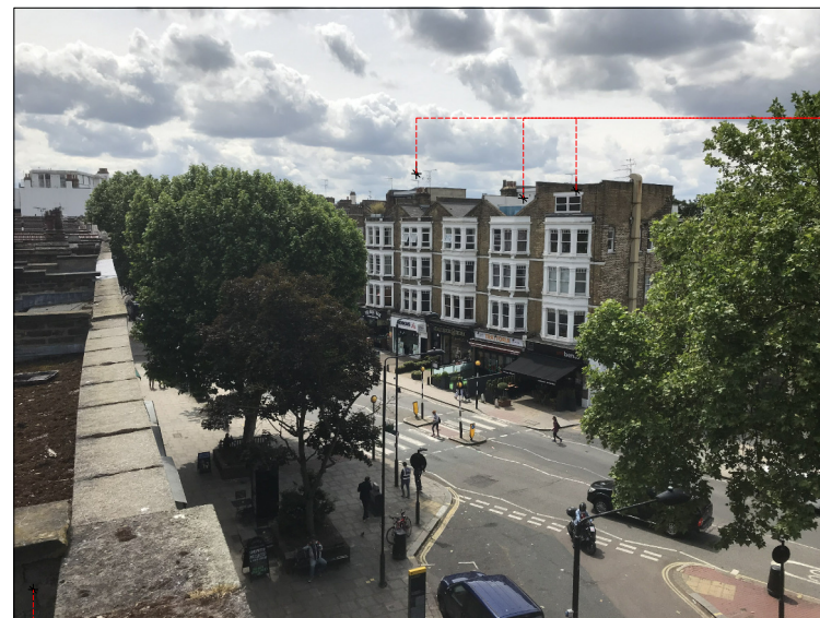
Corner to application site

3 no. existing Roof extensions Diagonally opposite to West End Lane No's: 315, 311 + 301