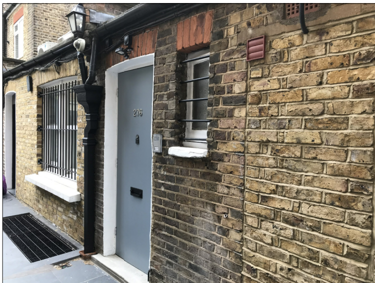
Existing windows to no. 276