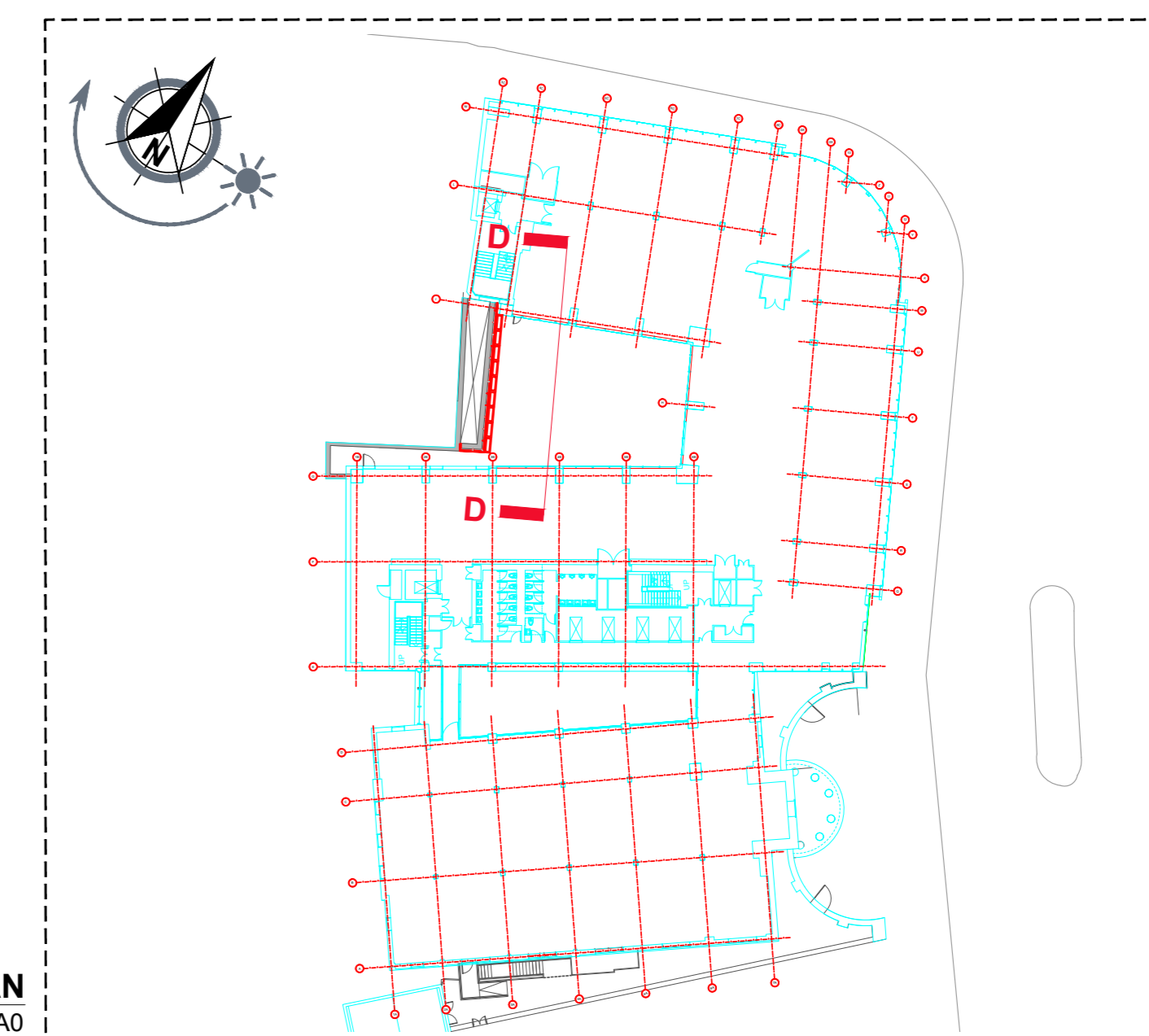
LOCATION PLAN 1:250 @ A0