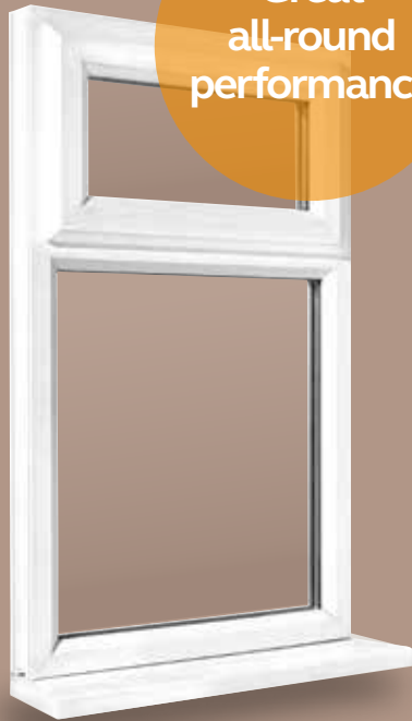
A Rated Double Glazed (standard for our Stormproof casements)

Best for harvesting the sun's free energy