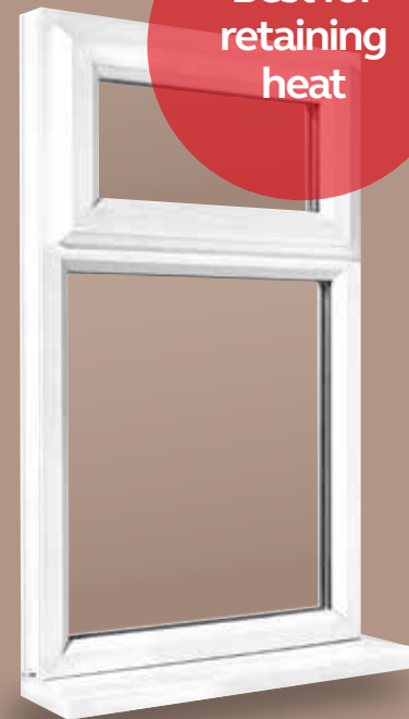
A++ Rated Triple Glazed (optional upgrade)