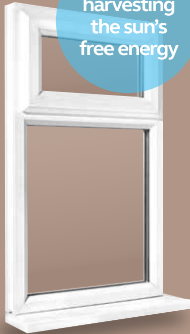
A+ Rated Double Glazed (optional upgrade for Stormproof casements and standard for Flush Finish casements)

Best for harvesting the sun's free energy