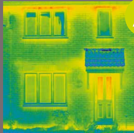
HEAT LOSS AFTER*

On a thermal image, extreme areas of heat loss show up as red patches.