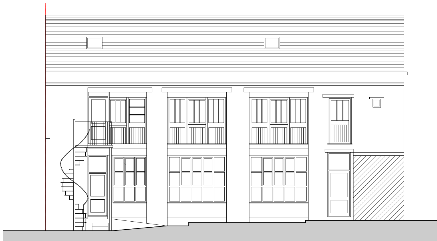
EXISTING FRONT ELEVATION Scale: 1/100