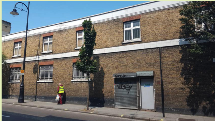
Photograph 3: Tree T3