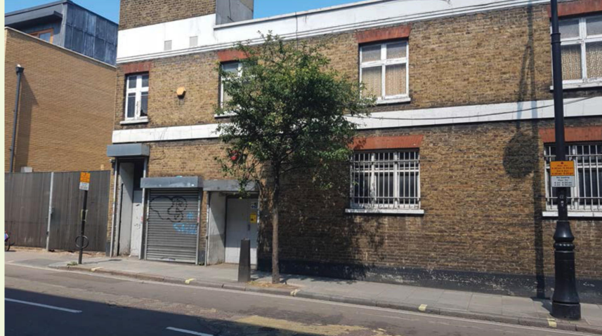
Photograph 2: Tree T2