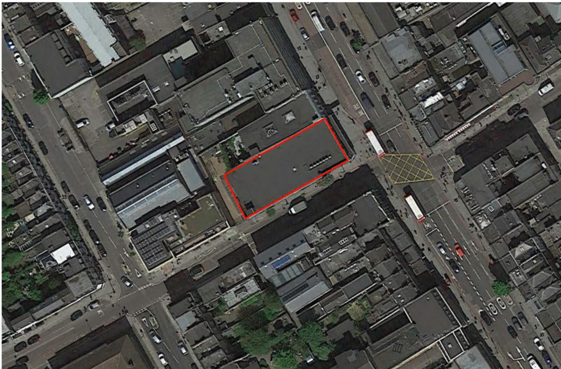
Figure 1: Location of Site and Environs