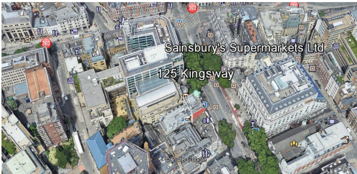
Image 1. Highlighting the rear of the host building