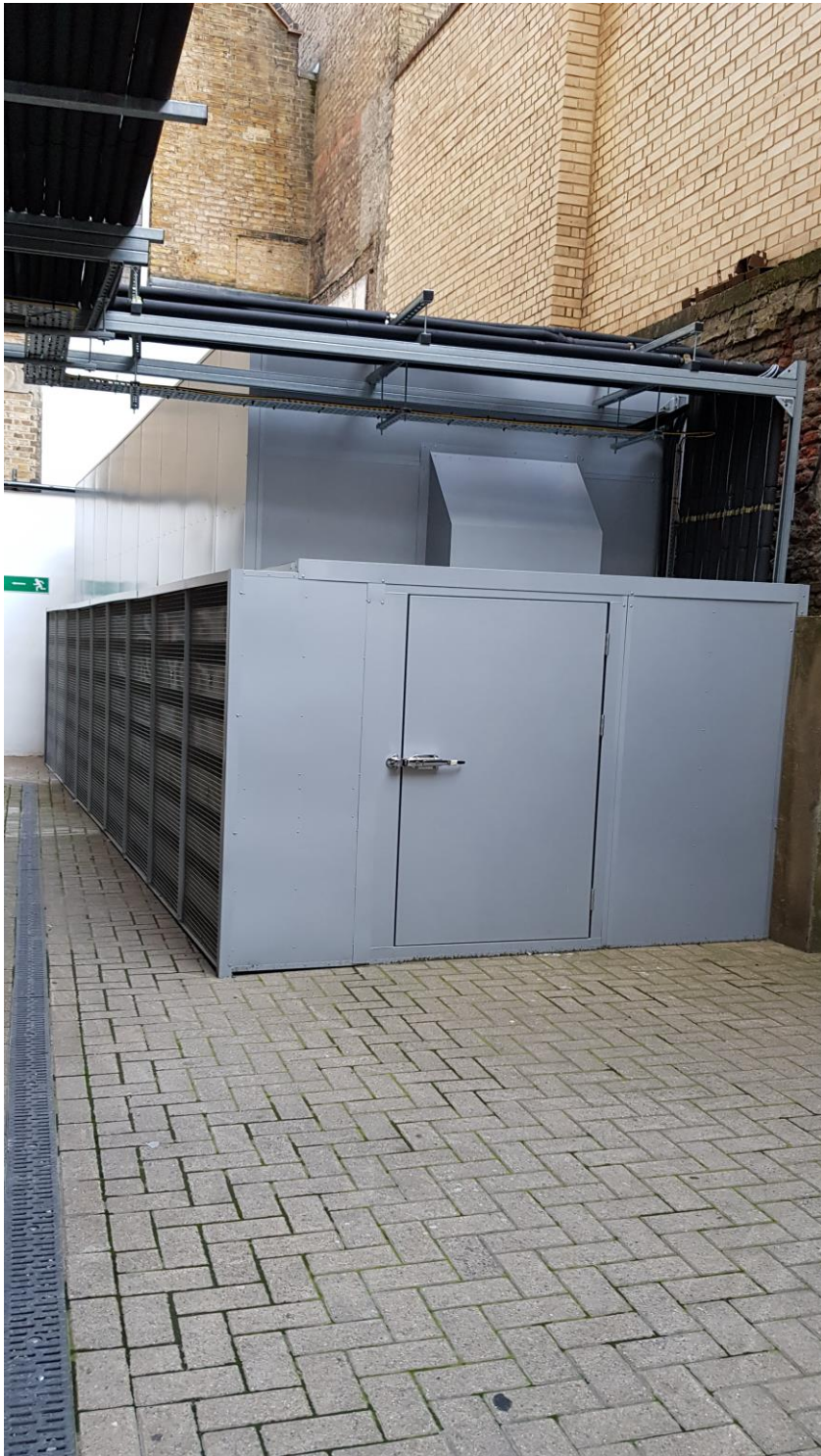
Image 4. Showing the depth of the acoustic enclosure.