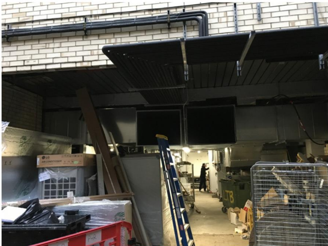
Image 2. Showing the ductwork and rear lightwell.