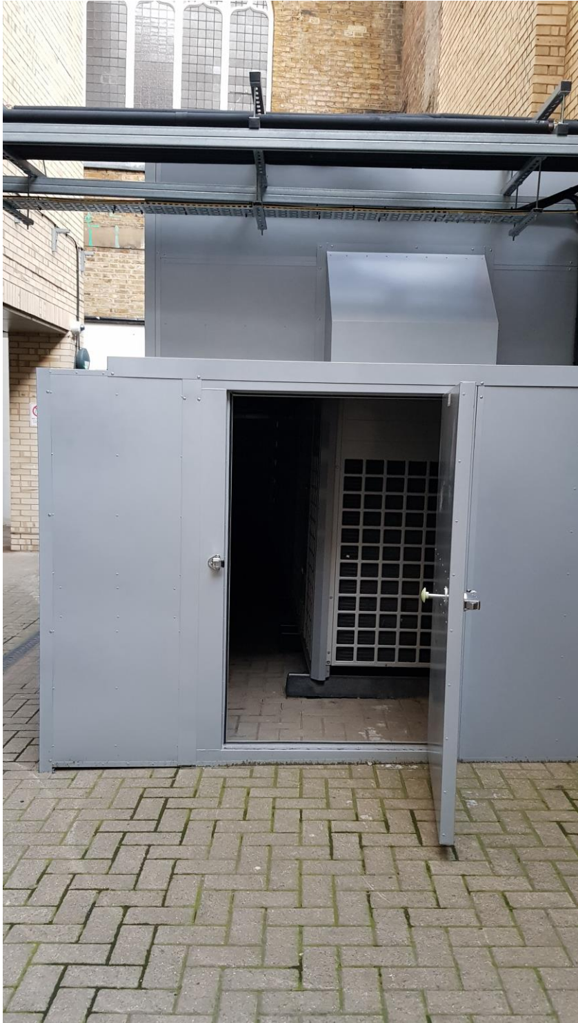
Image 3. The rear lightwell showing the air condenser units within its enclosure.