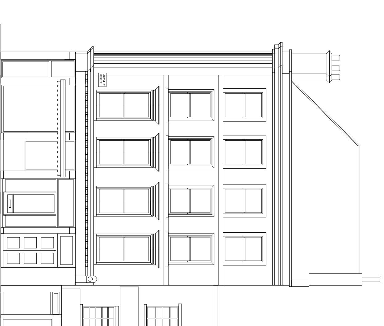
SOUTH ELEVATION AS EXISTING