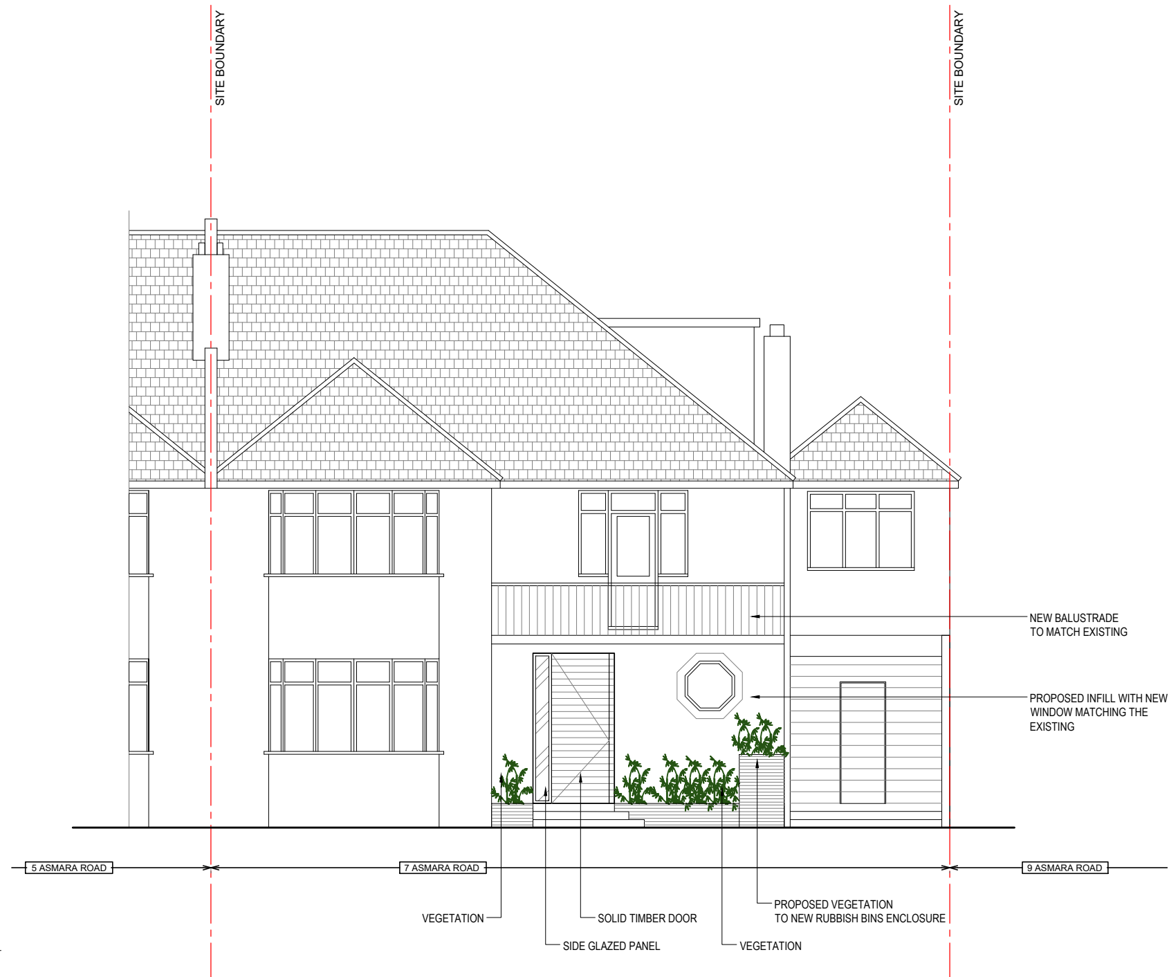
1 PROPOSED FRONT ELEVATION_ SCALE 1:100 @ A3