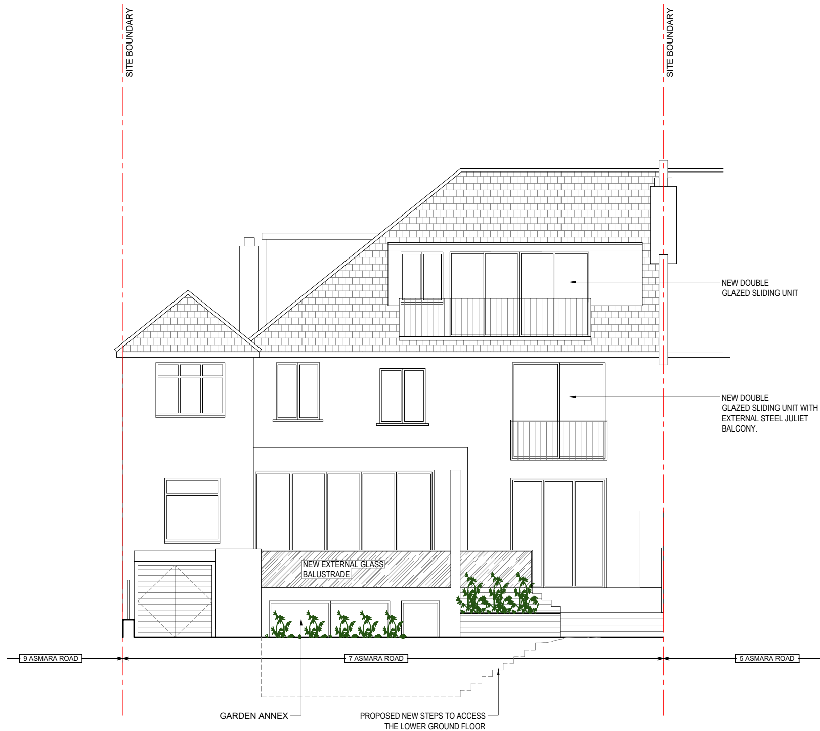
1 PROPOSED BACK ELEVATION_ SCALE 1:100 @ A3