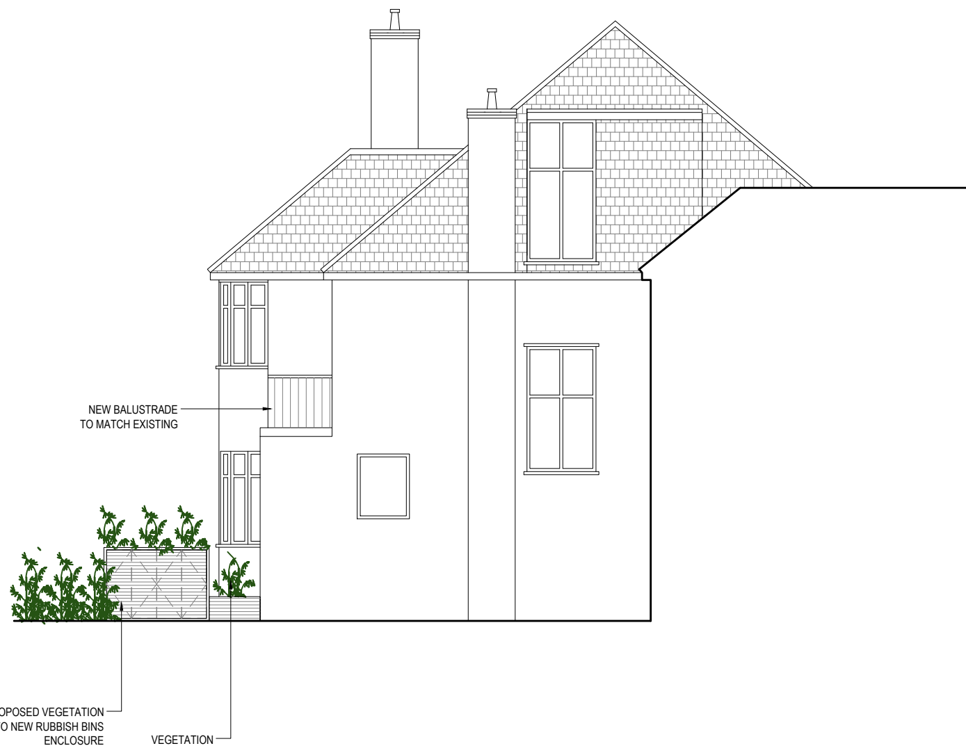
1 PROPOSED SIDE ELEVATION_ SCALE 1:100 @ A3