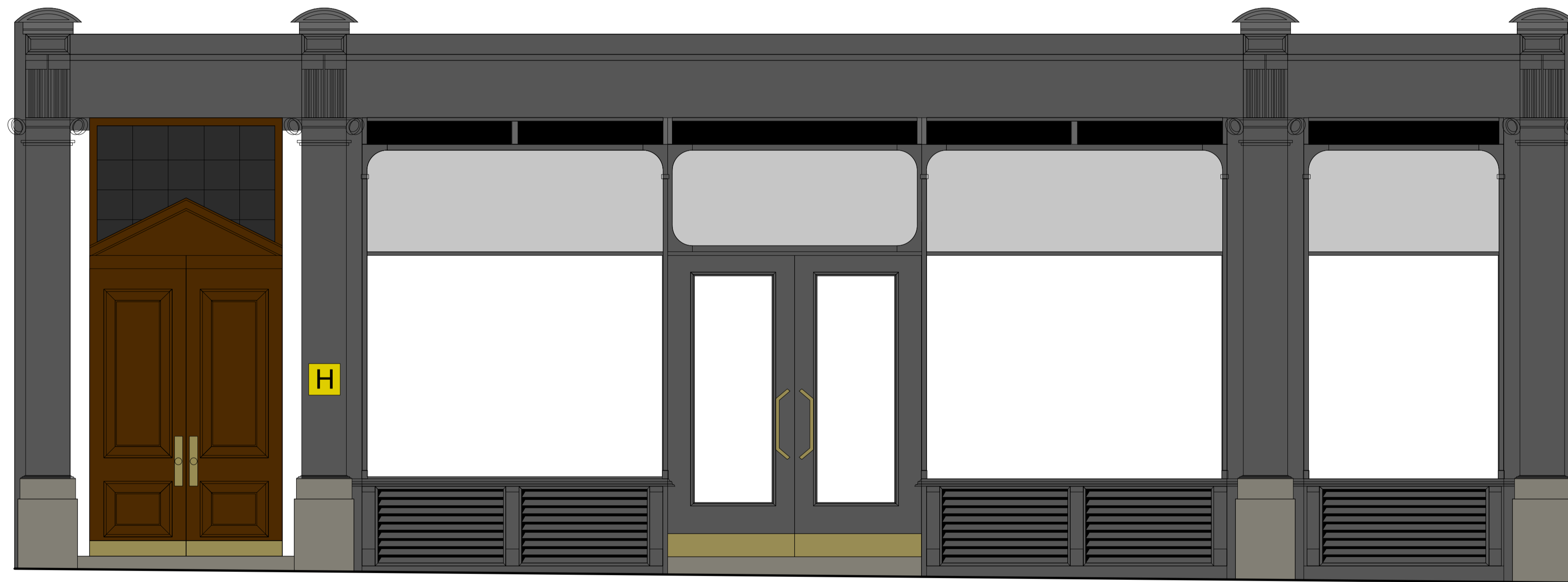
Existing storefront elevation