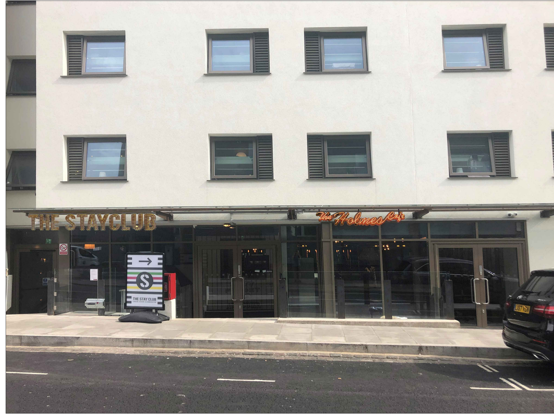
3D VISUAL IMAGE