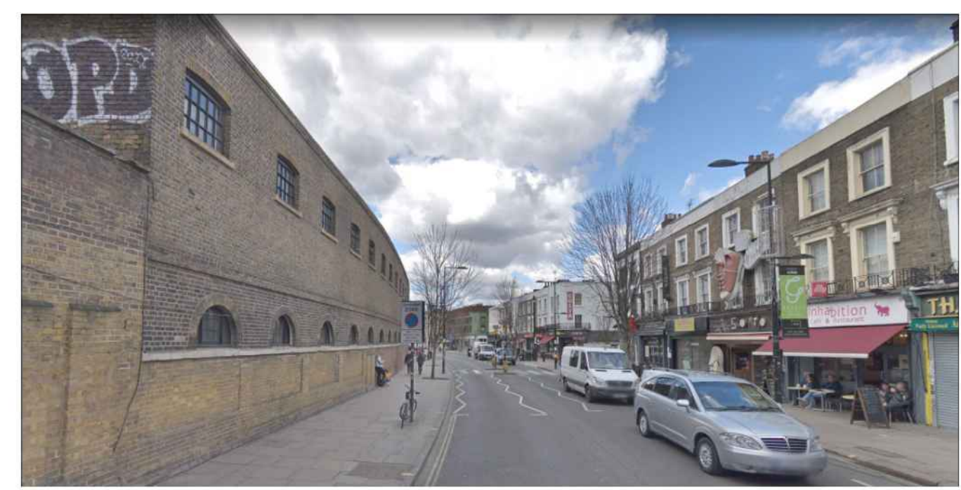
View from Camden looking towards site

CAMDEN HIGH STREET EVERSOLT ROAD CROWDALE ROAD