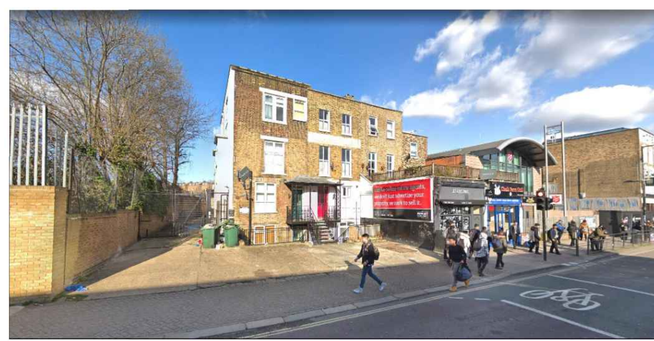
Front view of current site entrance