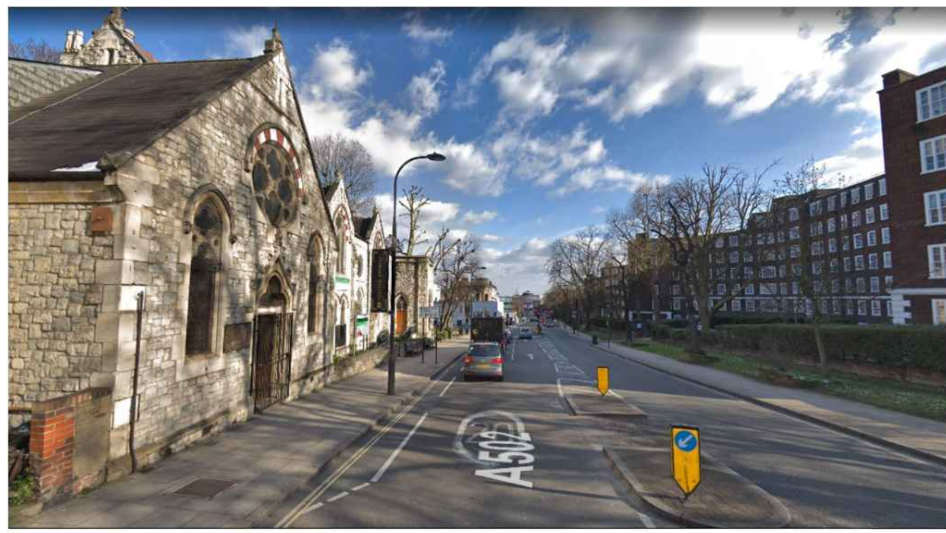
View from the top of Haverstock Hill looking down towards site

General Notes The drawing is copyright of Vabel LTD. All rights reserved. No reproduction in any material form is permitted without consent. Do not scale from this drawing. All dimensions are in mm unless stated otherwise. Dimensions, levels, sizes and location of particulars are to be verified by the contractor on site prior to engaging in works. This drawing may incorporate information from other professionals. Vabel LTD cannot accept responsibility for the integrity and accuracy of such information.