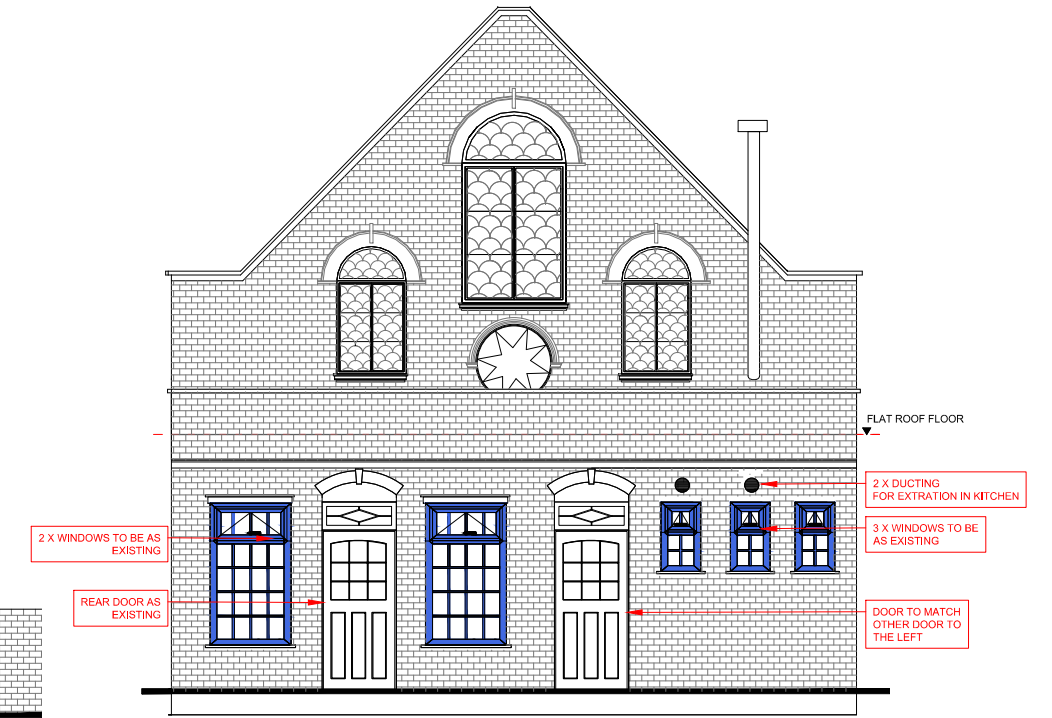
D Proposed Rear Elevation Scale: 1:100