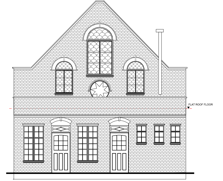
B Existing Rear Elevation Scale: 1:100