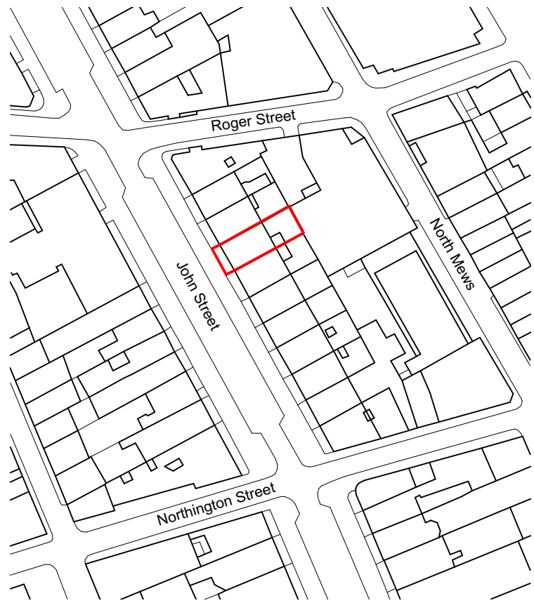
1 Location Plan L-01 Scale: 1:1250