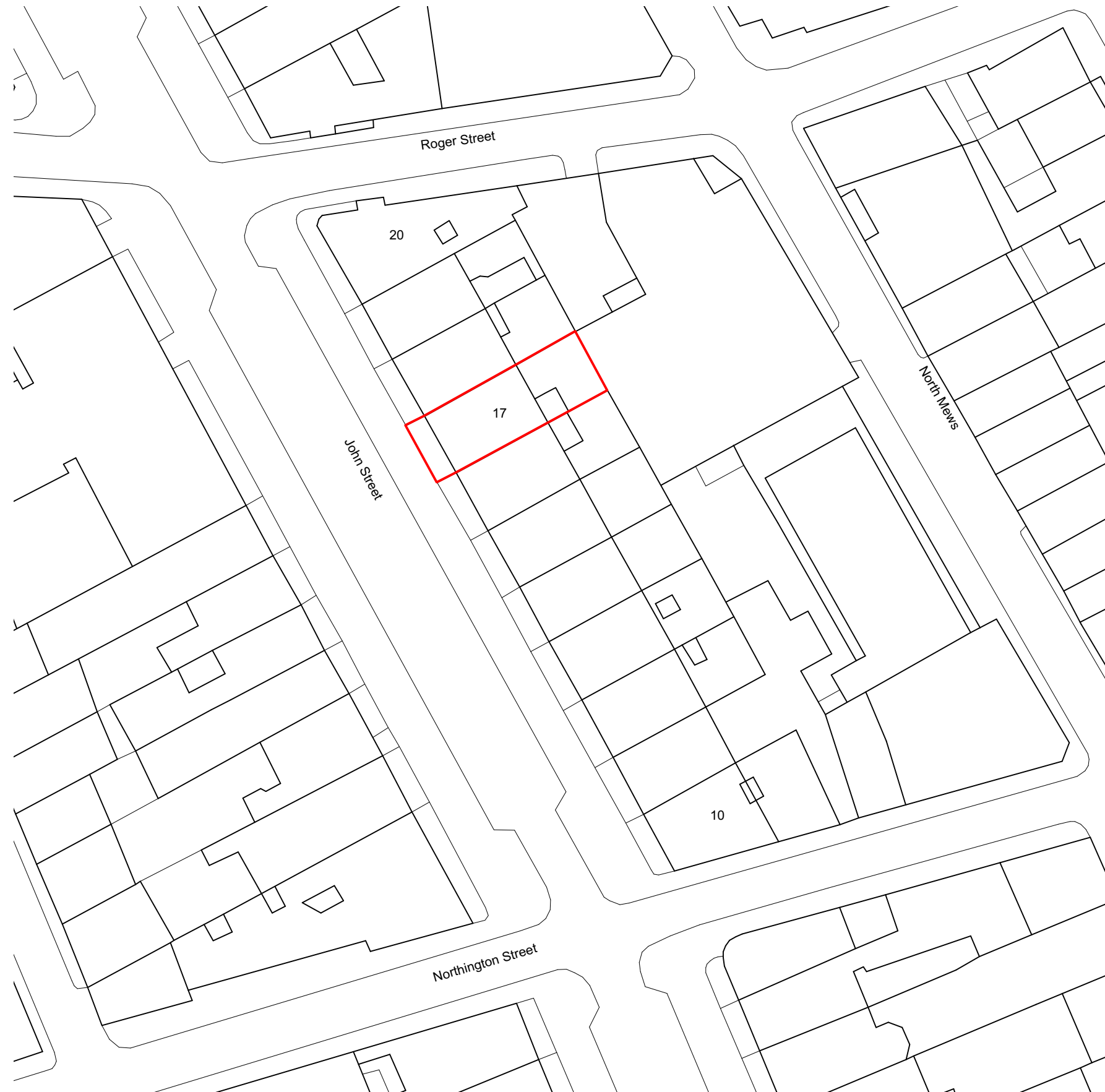
2 Site Plan L-01 Scale: 1:500