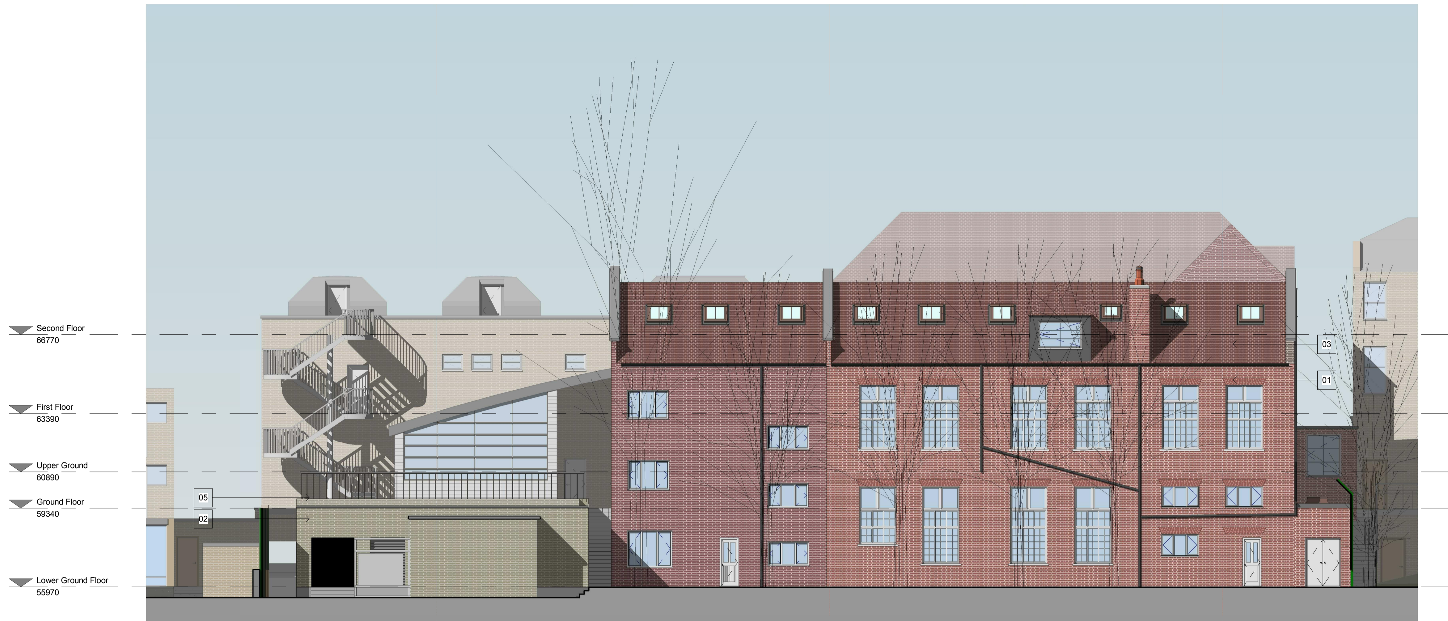
Existing East Elevation (Rear) 1 : 100