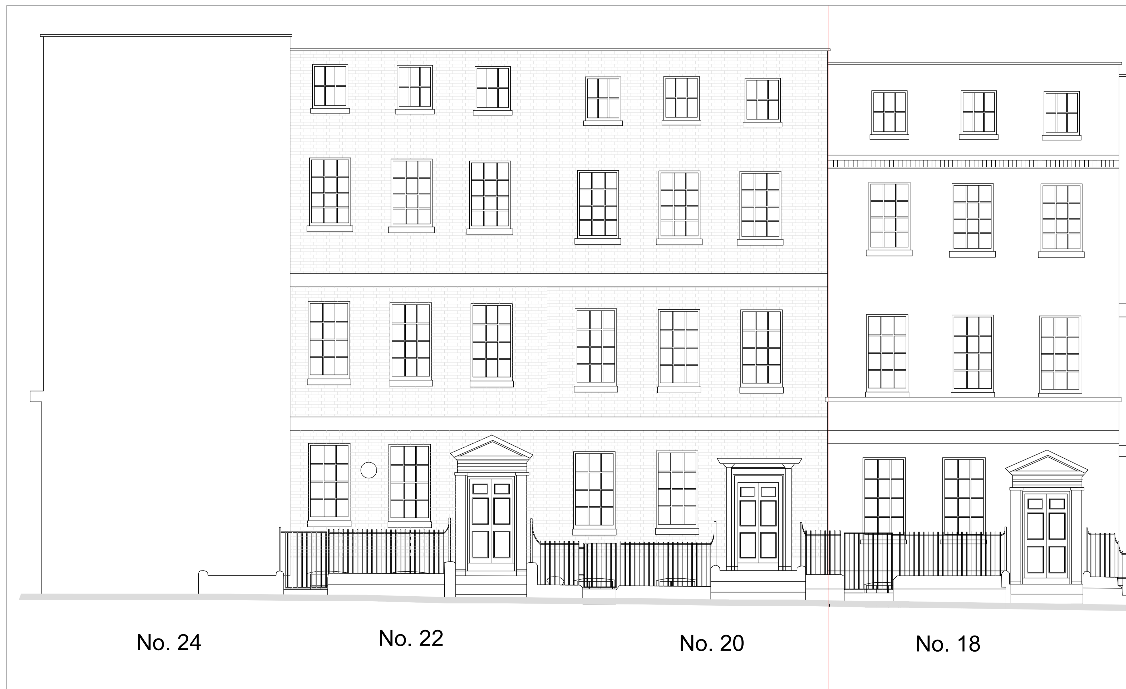
01 Existing Elevation - Theobalds Road