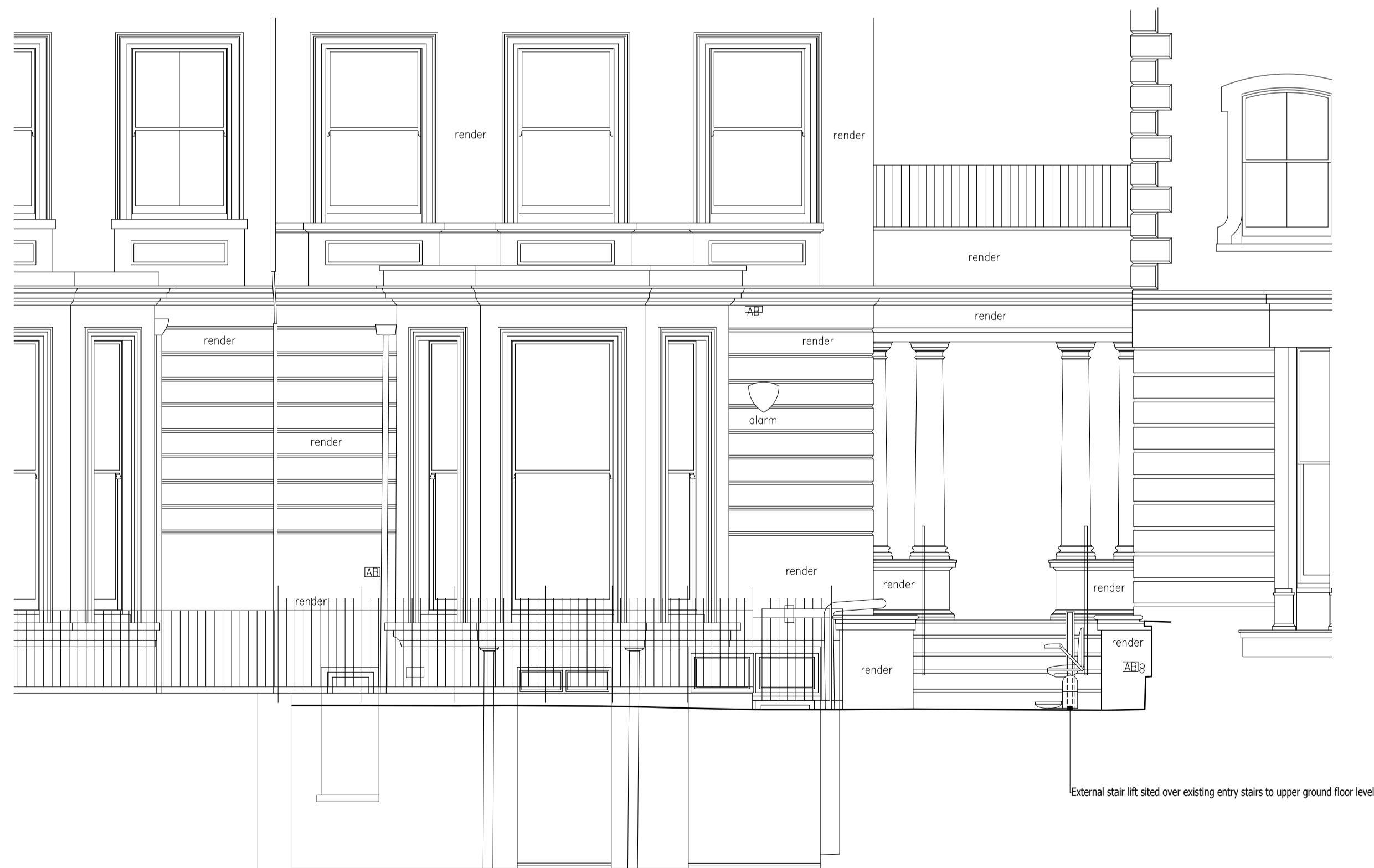
03 Section AA (Front Elevation) - As Existing scale 1:50 @ A1