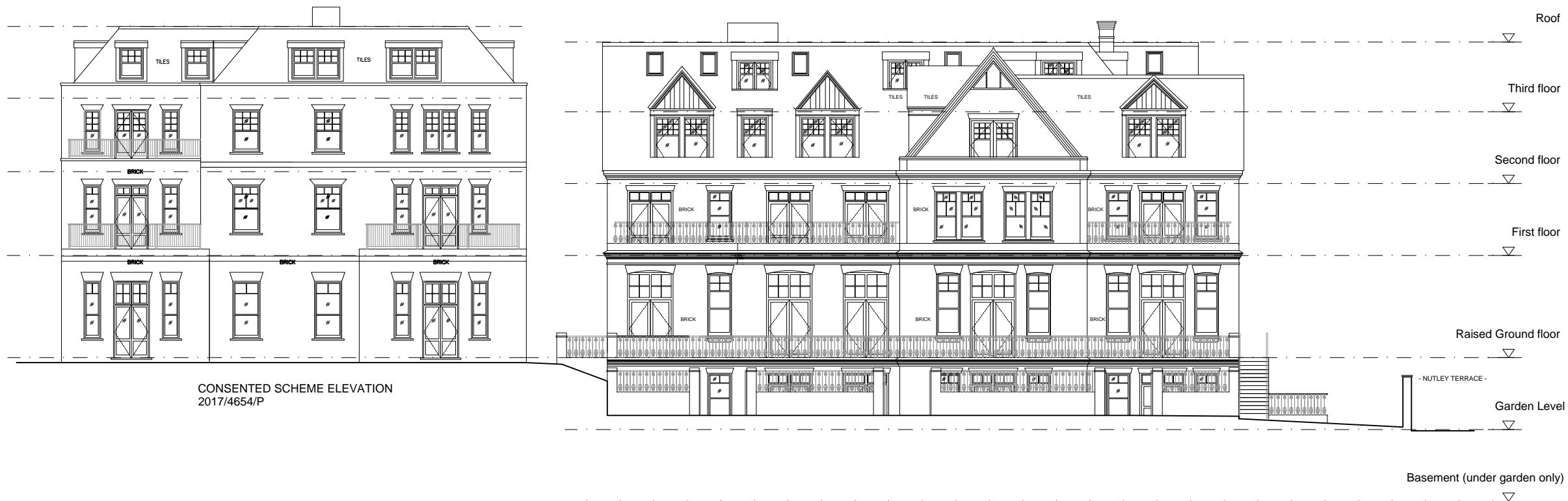
Proposed West street elevation Scale 1:200@A3