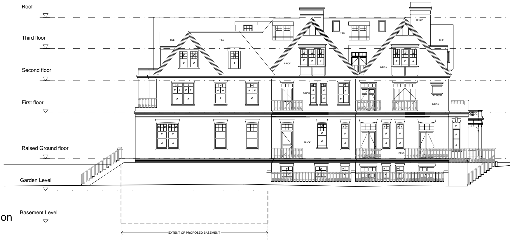
Proposed South street elevation Scale 1:200@A3