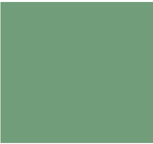
RAL 6021 Pale Green