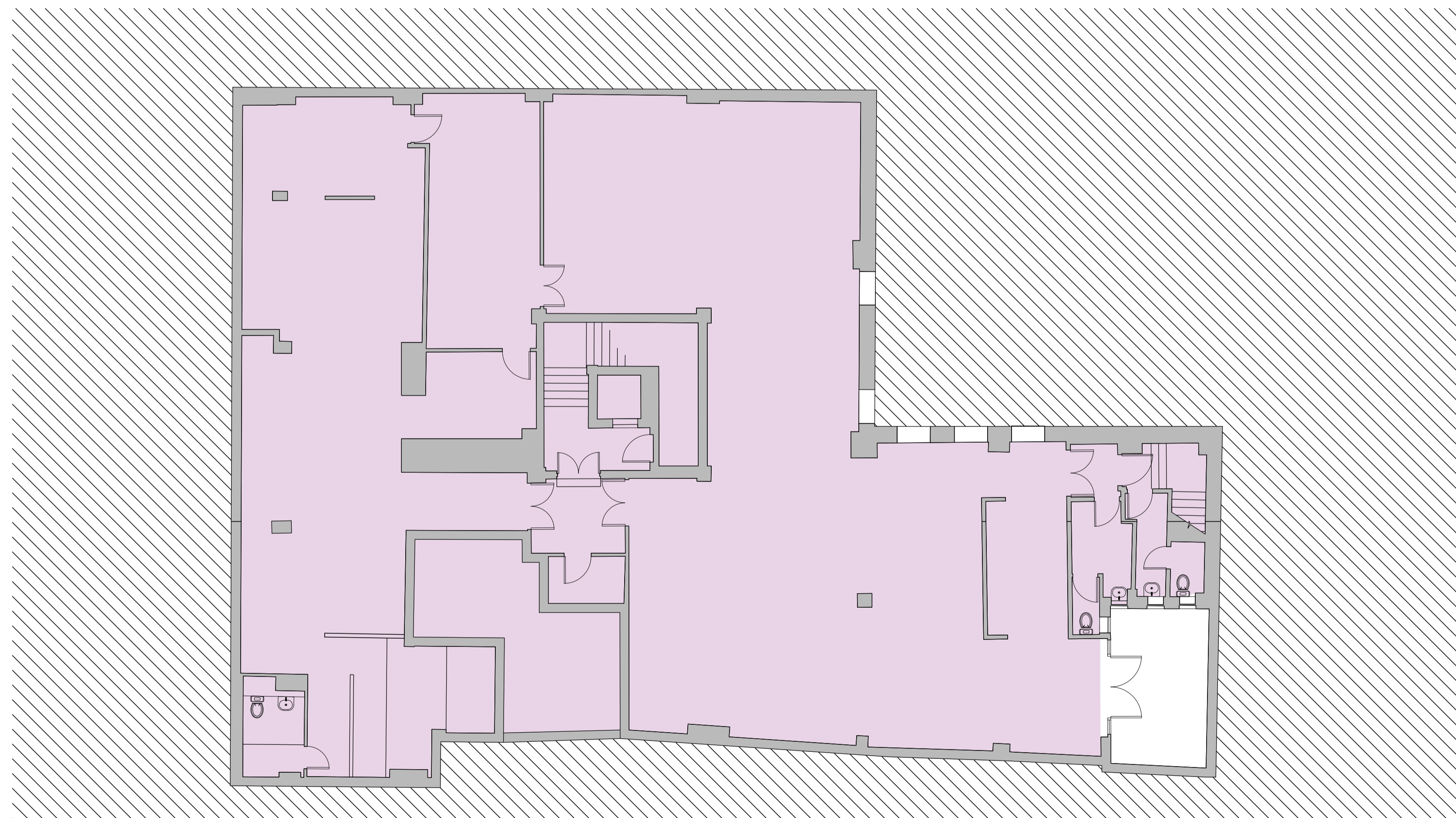
Existing Basement Plan GIA 452.24 sqm / 4867.87 sqft NIA 392.22 sqm / 4221.82 sqft