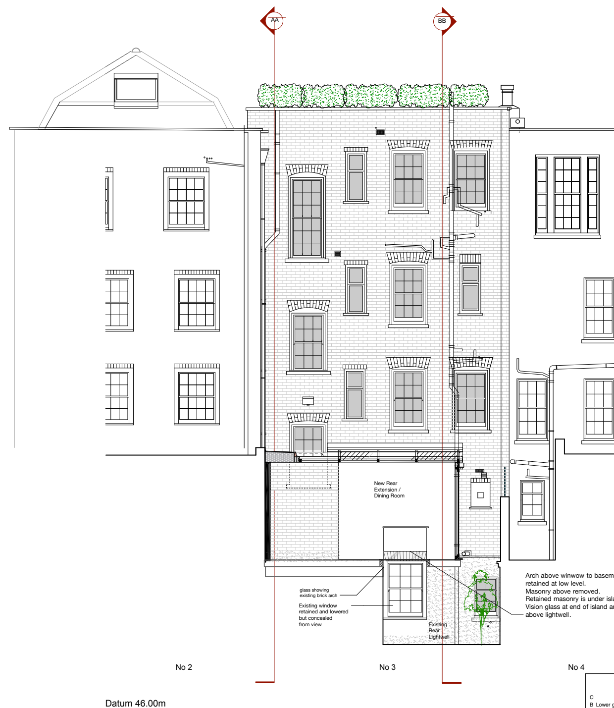
2 PROPOSED NORTH / REAR ELEVATION 1:50 @A1