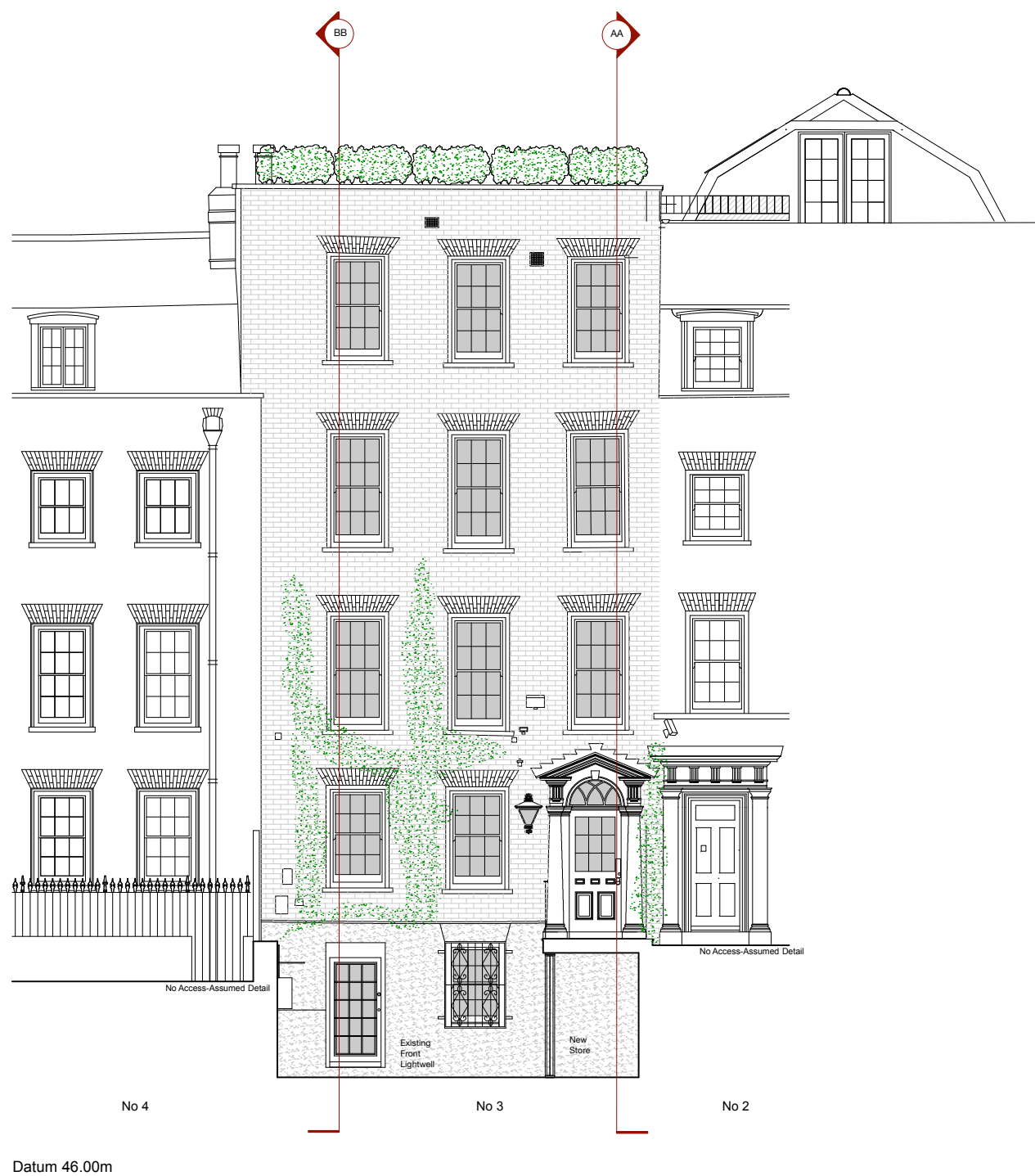
1 PROPOSED SOUTH / FRONT ELEVATION 1:50 @A1