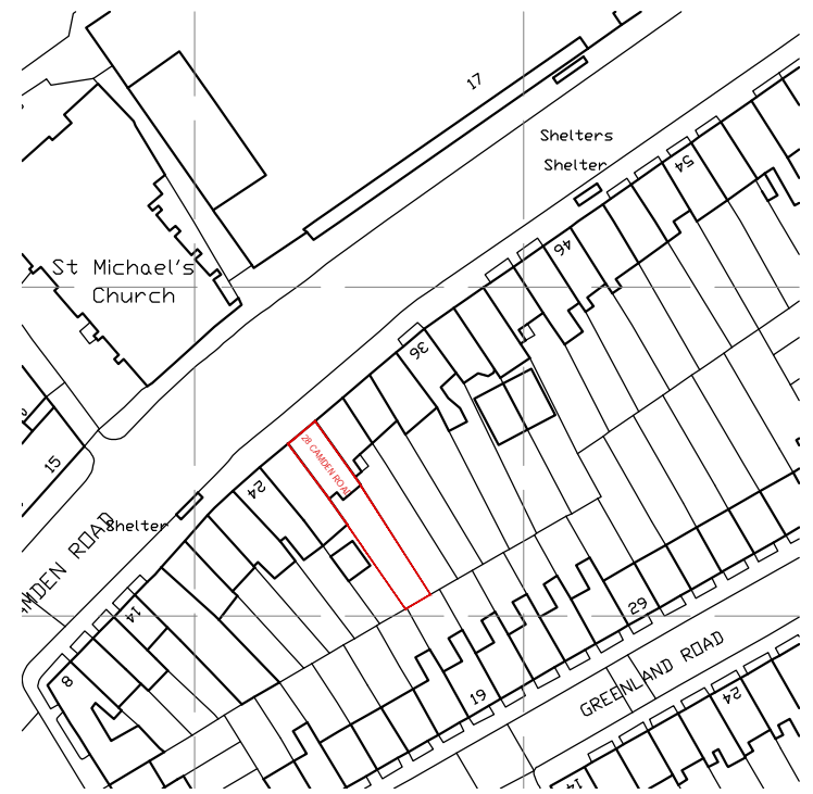
Block Plan 1:1250