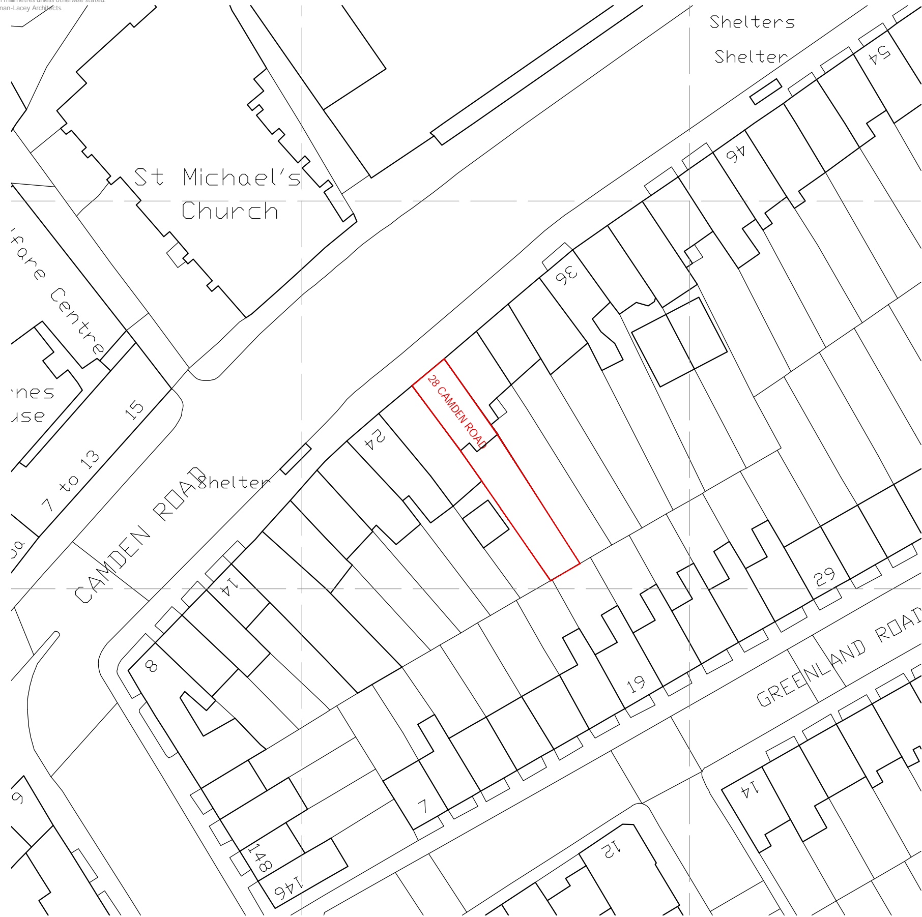
Location Plan 1:500