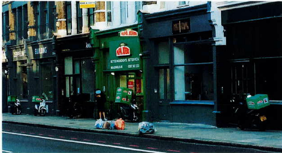
Photo: 5 mopeds parked on footpath outside Papa Johns, 20m from the proposed Dominos (right side of photo) taken 18:22 15 July 2019