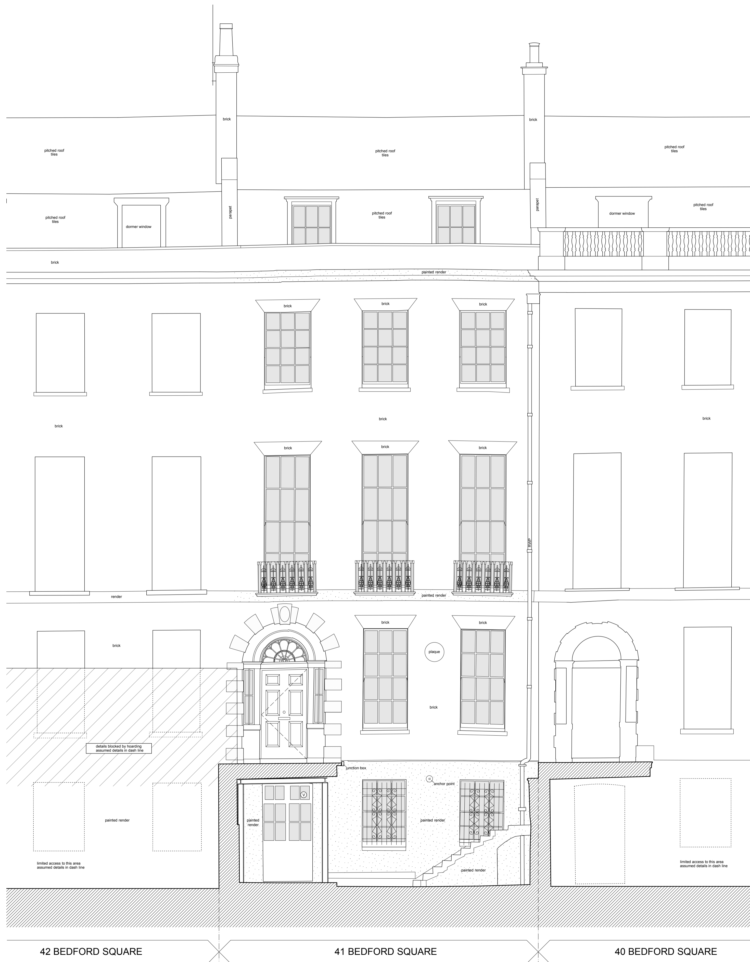
1 Existing Front Elevation - 41 Bedford Square PL_018 1:50 @ A1