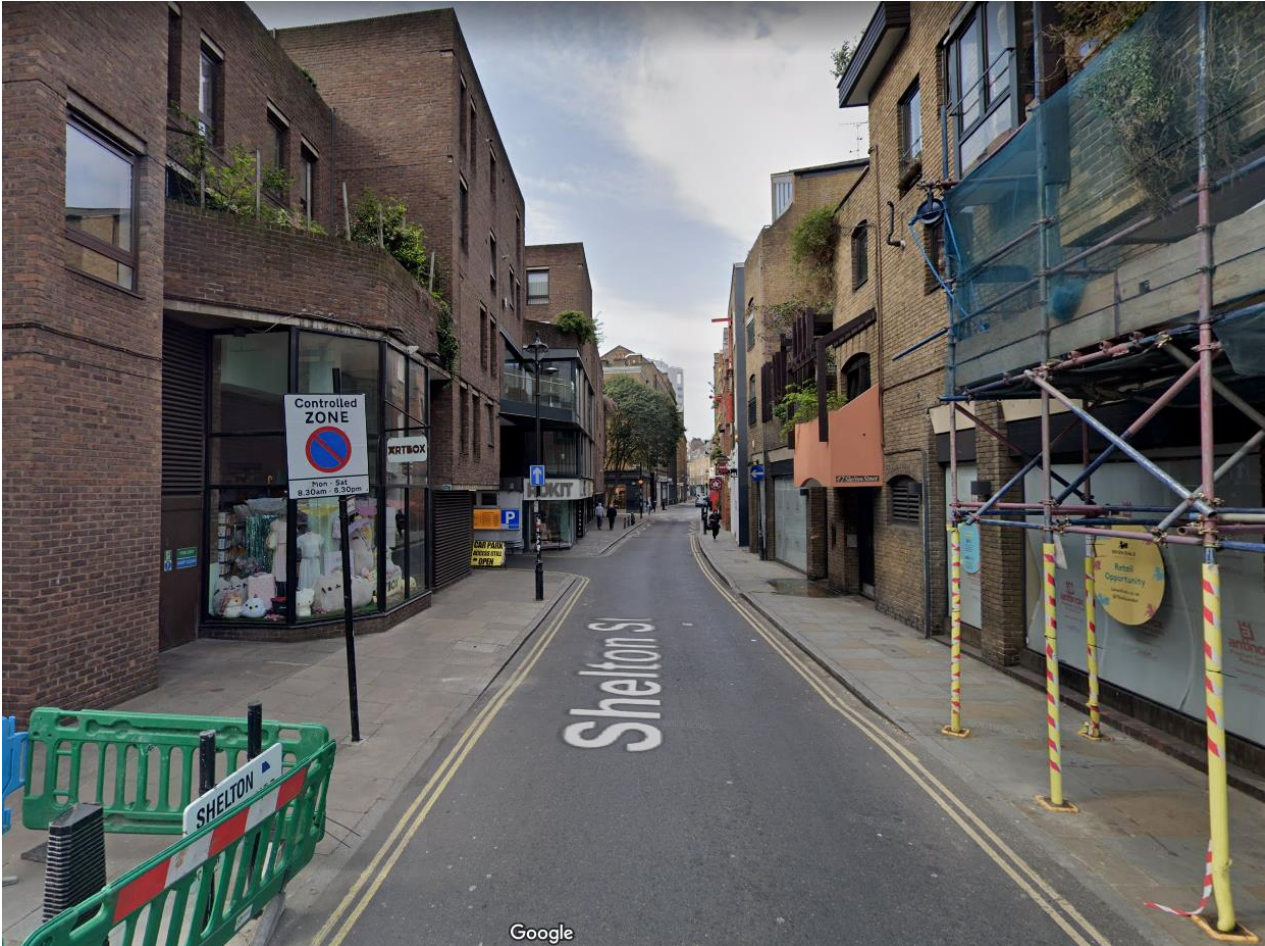
Google Shelton Street – Looking South