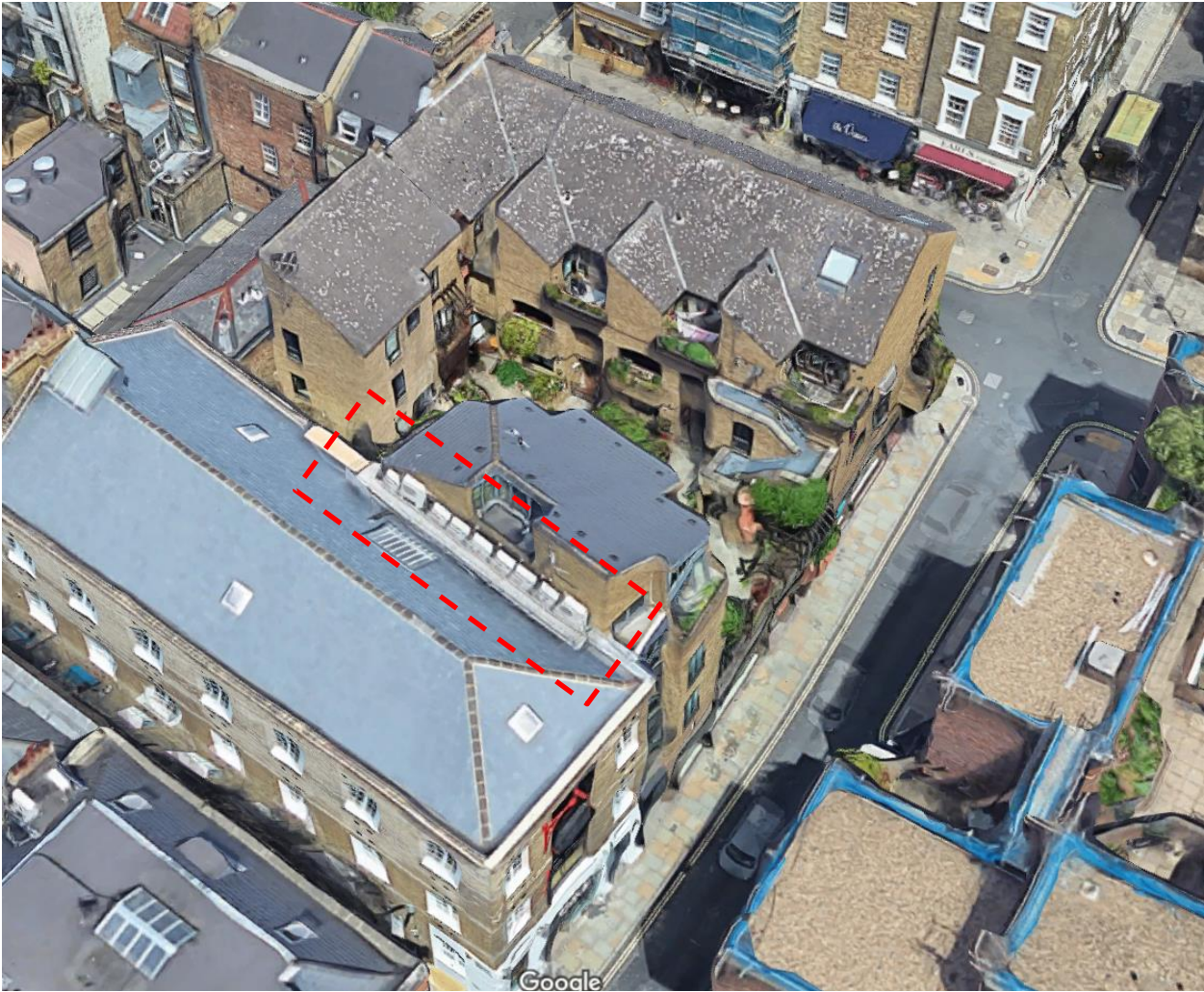
43-47 Shelton Street - Existing Roof Level Condensers