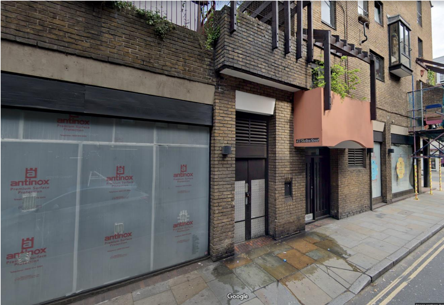
Shelton Street - Existing Shopfront