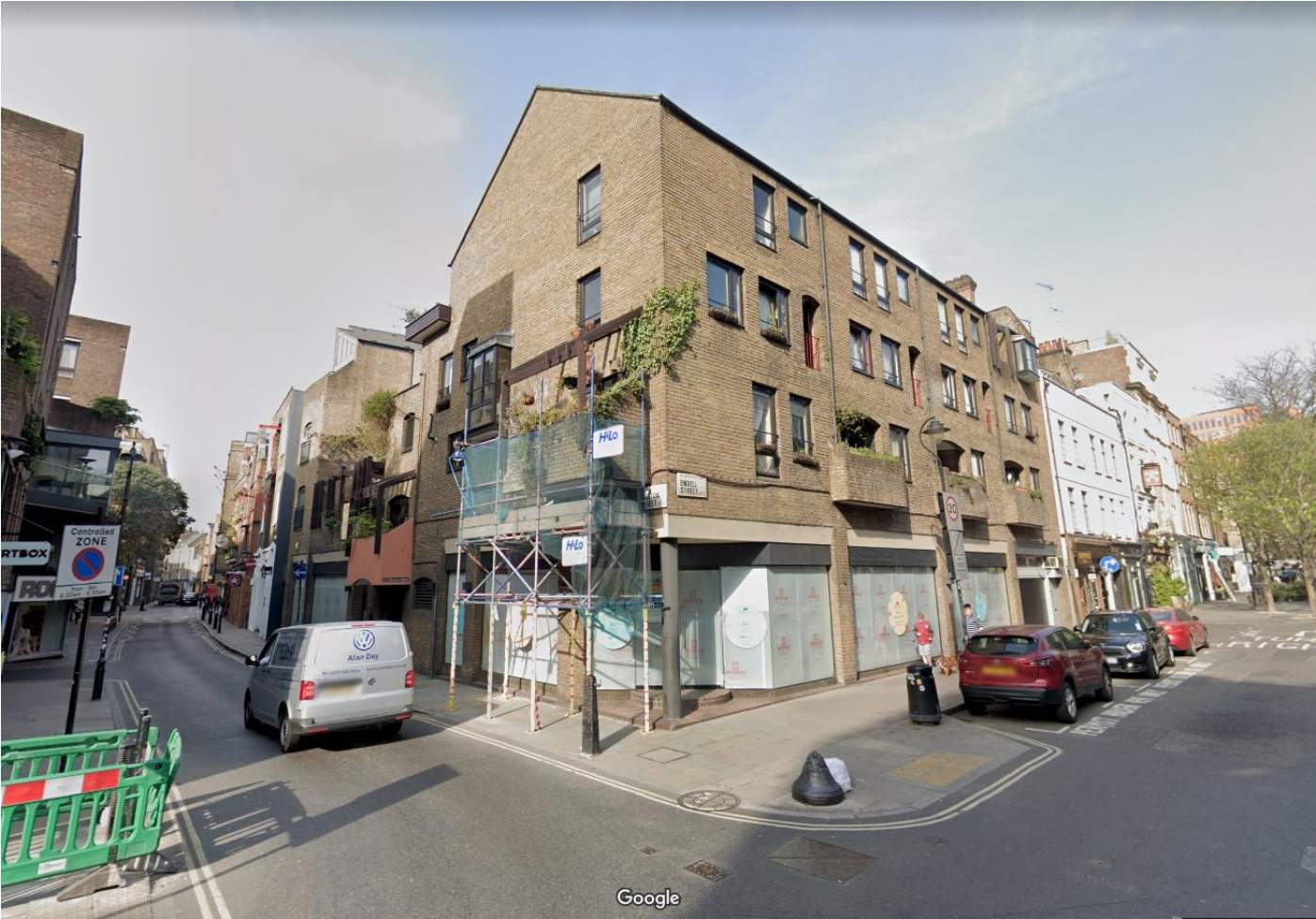
Endell / Shelton Street – Looking West