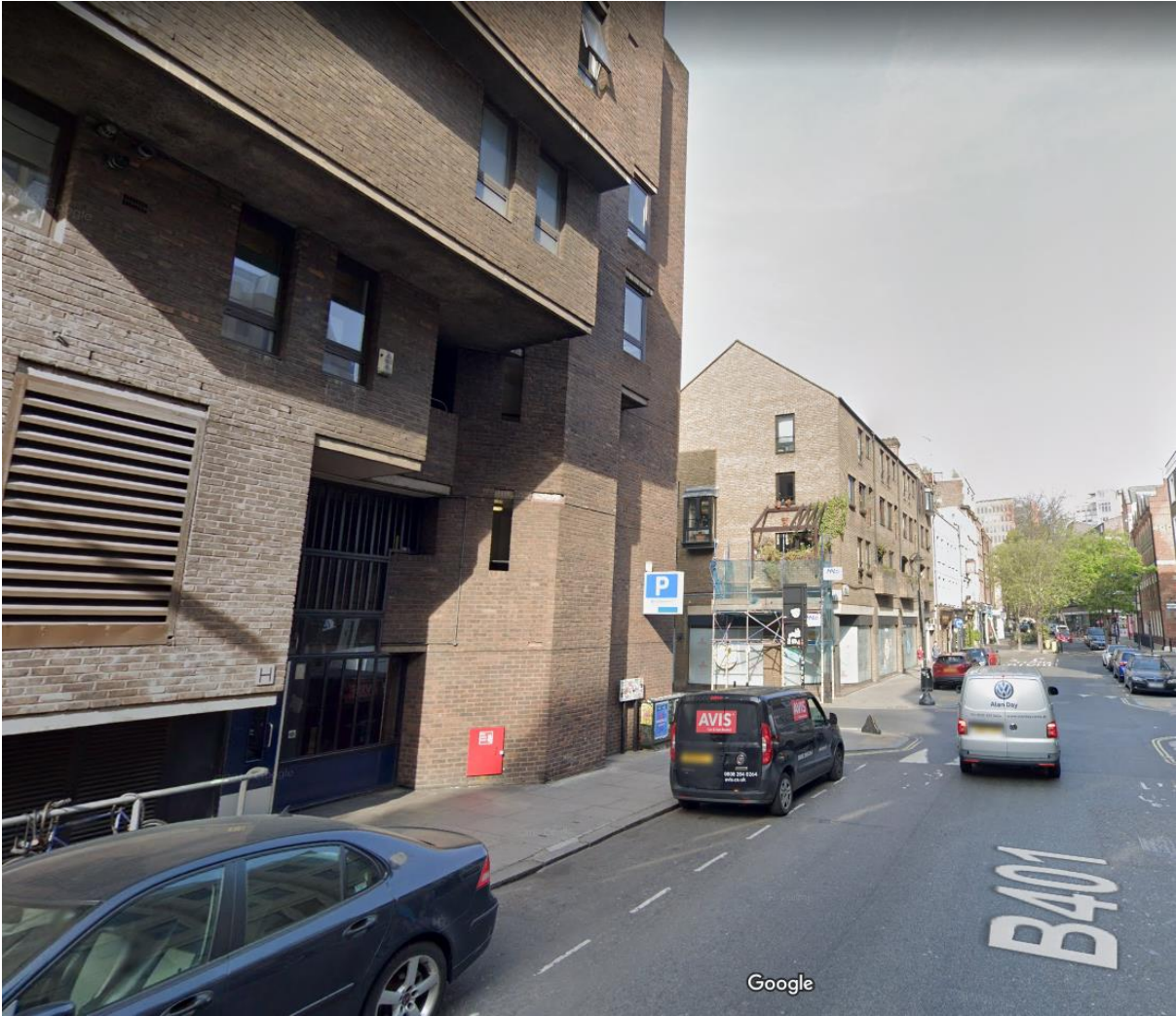
Endell Street – Looking North