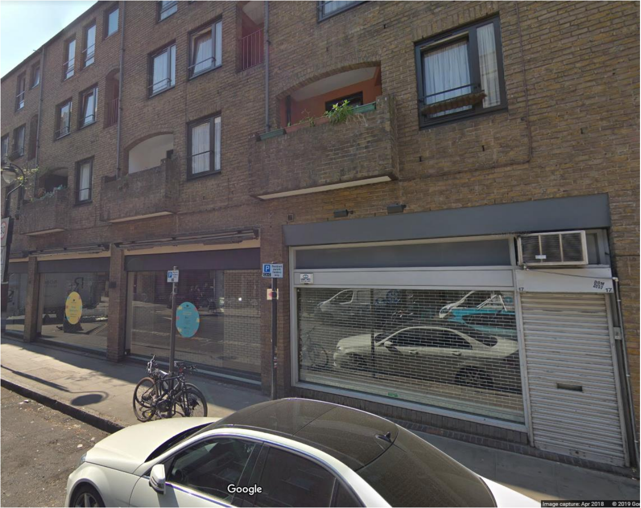
Endell Street - Existing Shopfront