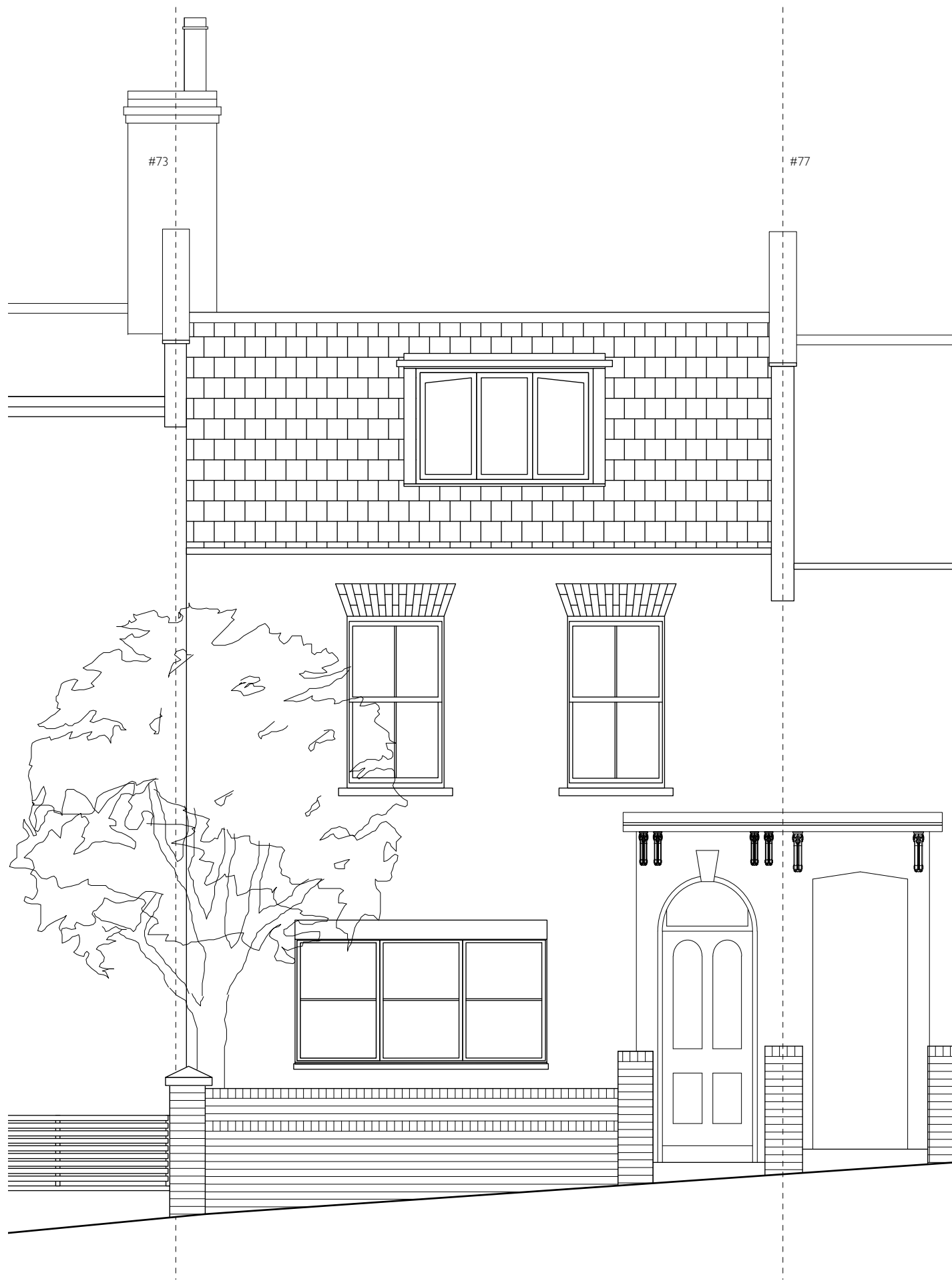
1 FRONT ELEVATION 1:50 @ A3