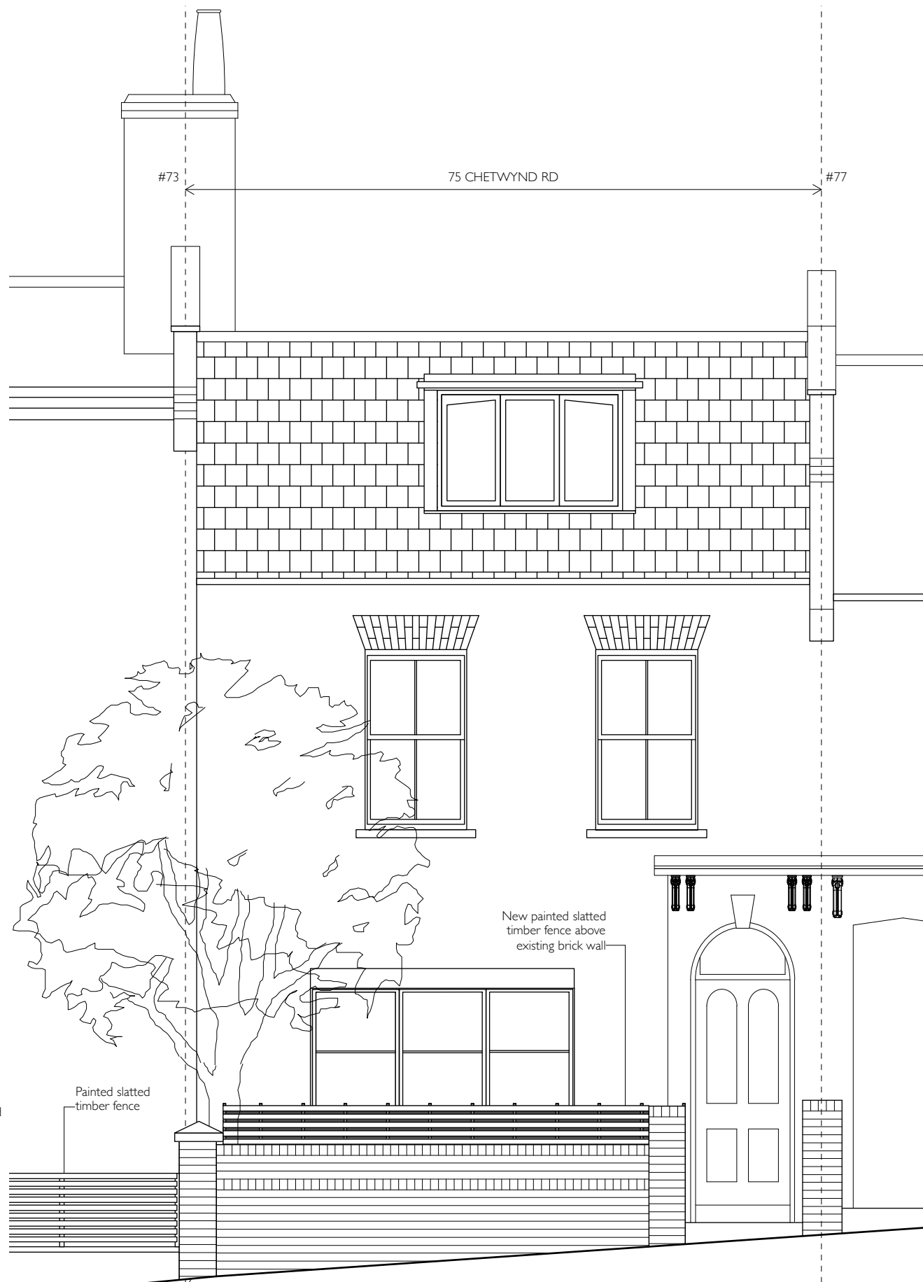
2 FRONT ELEVATION 1:50 @ A3