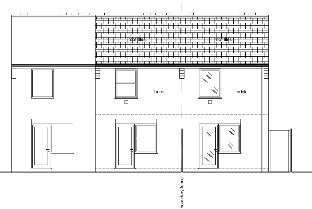
EXISTING REAR ELEVATION (C)