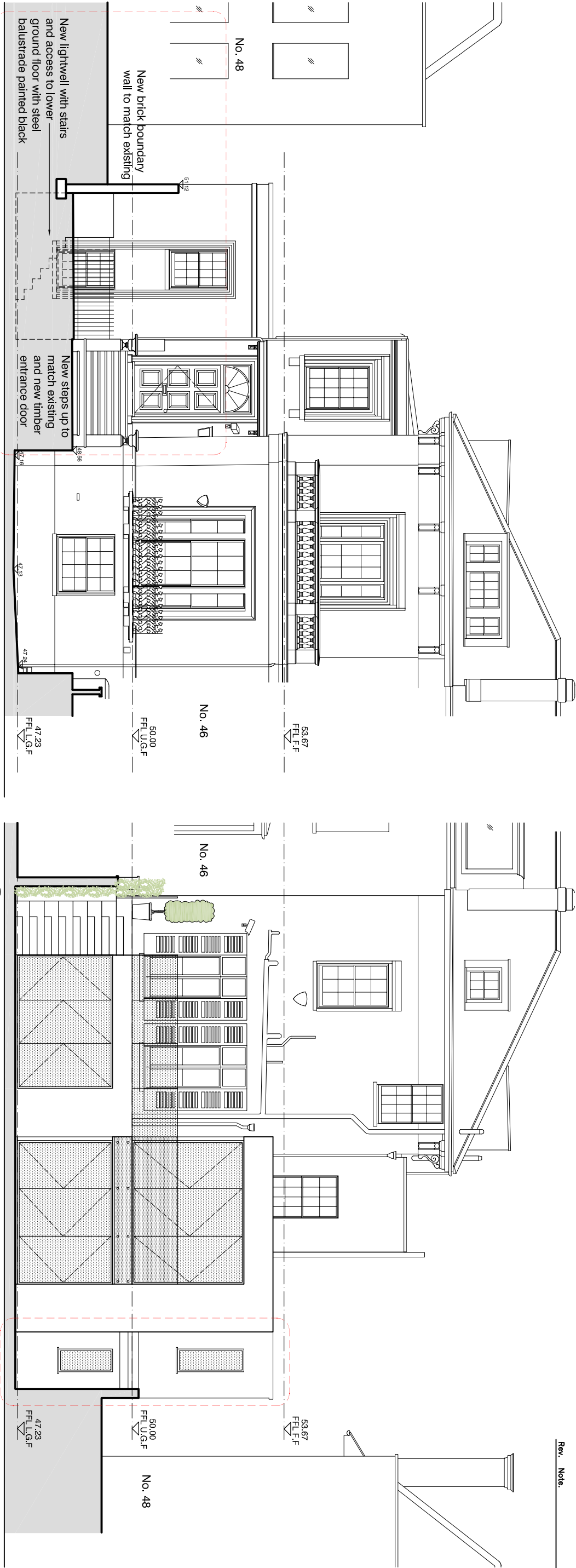
PROPOSED FRONT (SE) ELEVATION Scale 1:100 PROPOSED REAR (NW) ELEVATION Scale 1:100

--- Areas where change is proposed from consented works associated with applications: 2015/5630/P & 2018/1758/P 0 5m