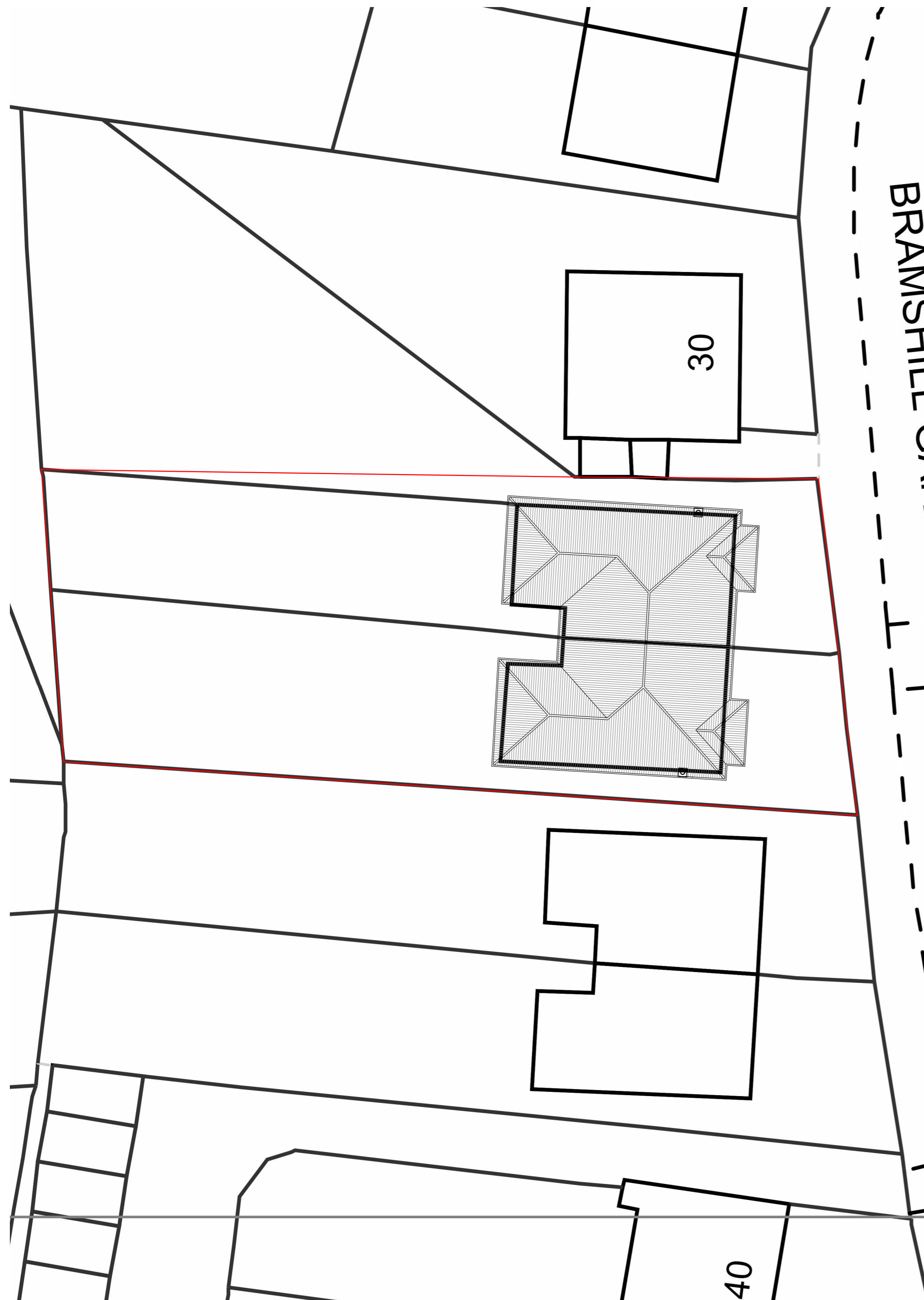
1 Existing Site Plan 1:200