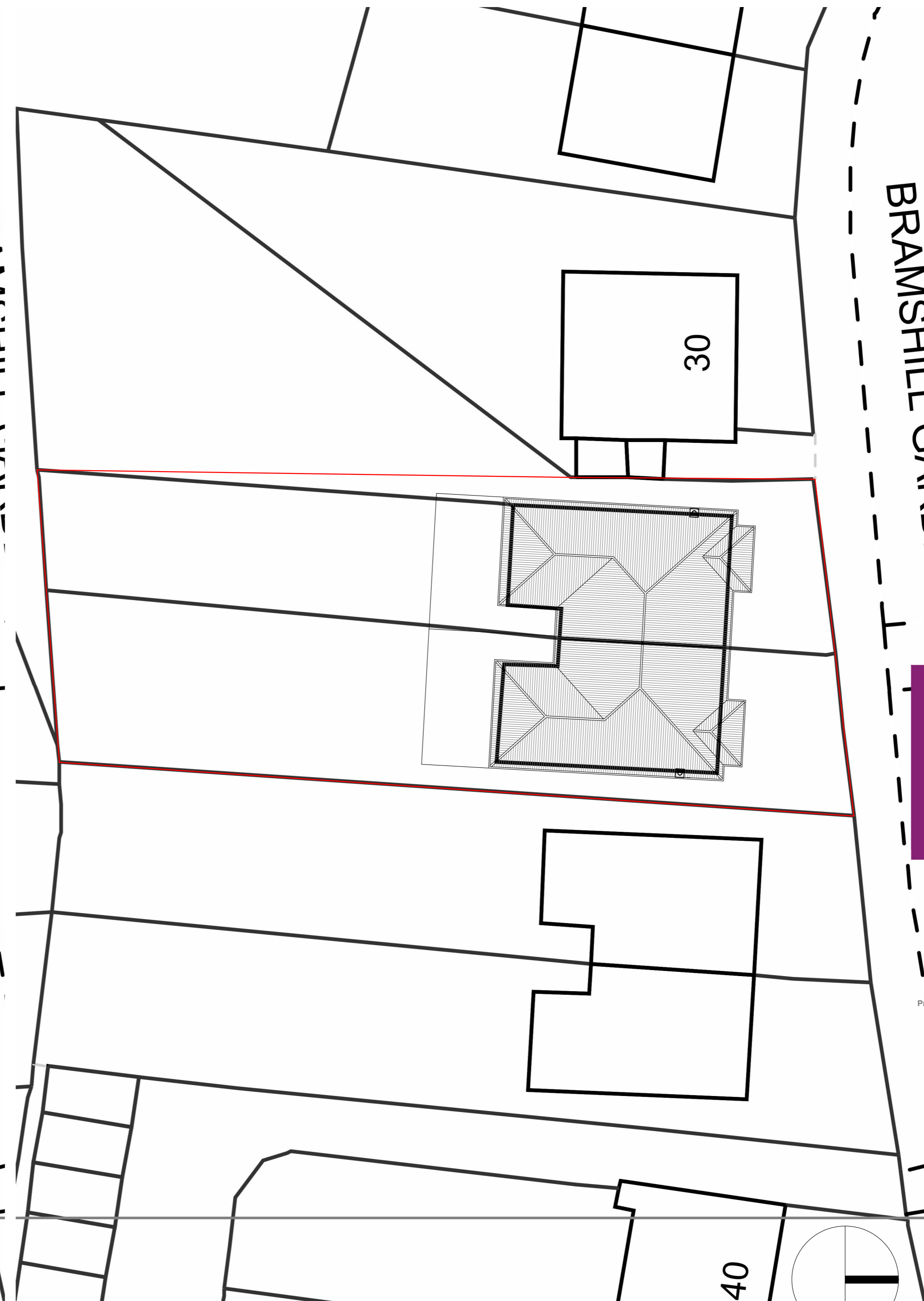
2 Proposed Site Plan 1:200