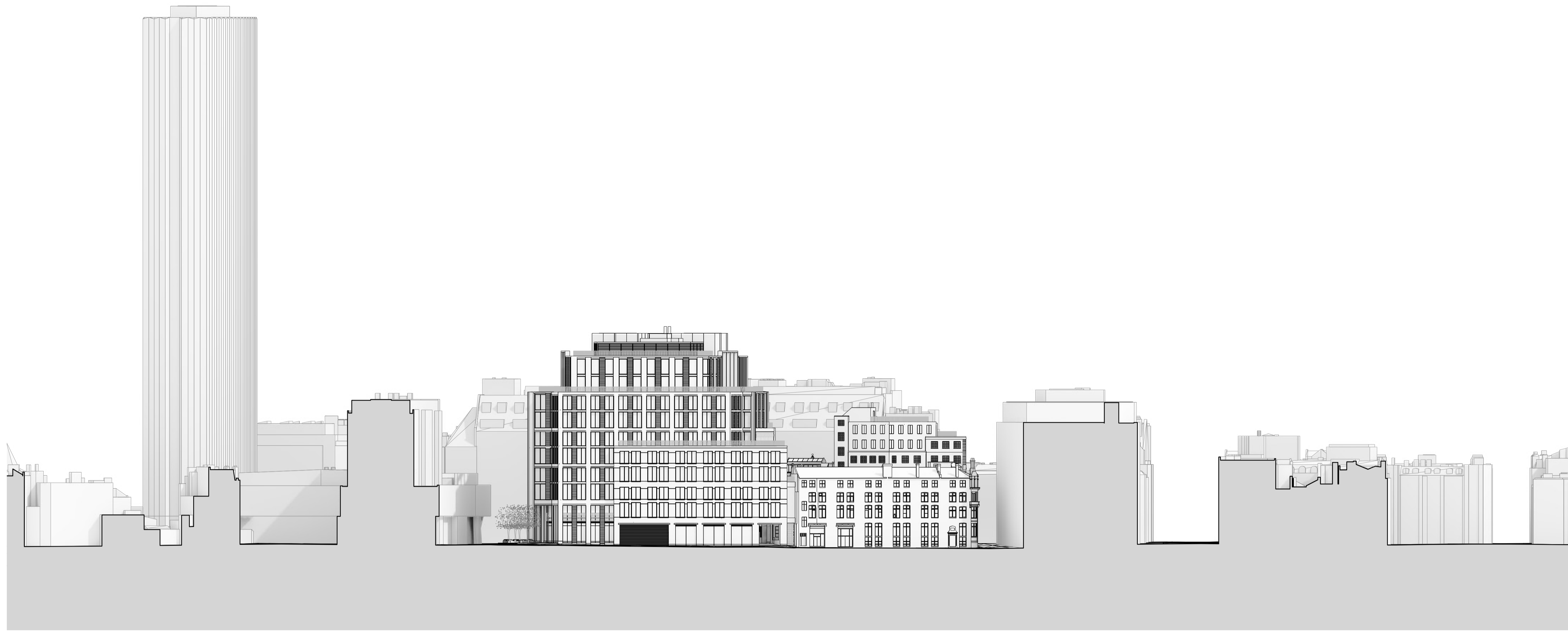
01 South Elevation 1:500

Disclaimer Do not scale from this drawing. Check all dimensions on site before fabrication or setting out. This document is copyright and may not be reproduced without permission of the owner.