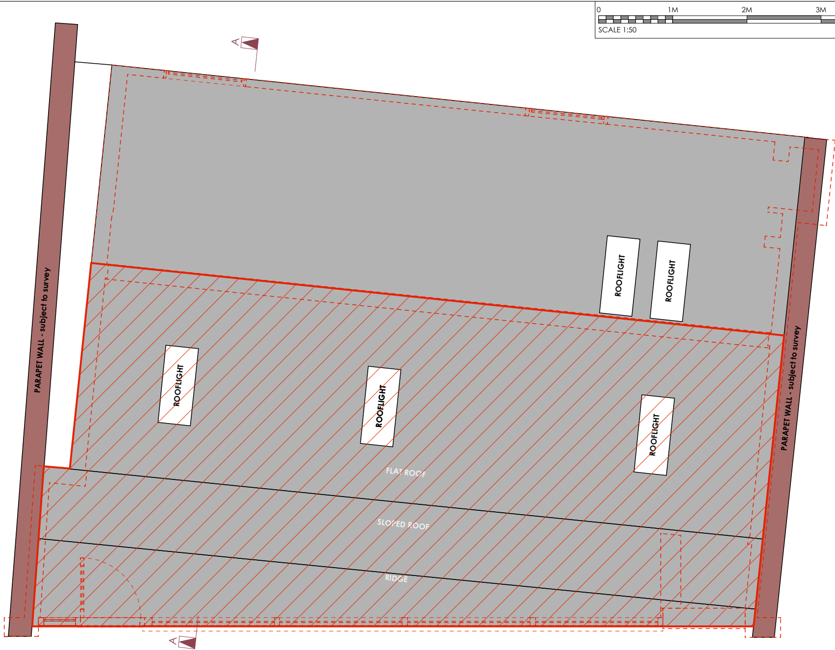
existing roof plan