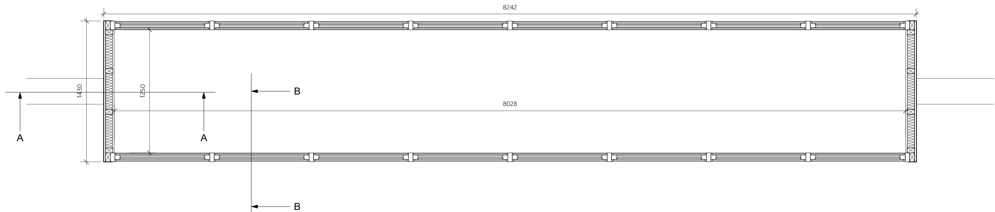
EXISTING LANTERN PLAN 1:20